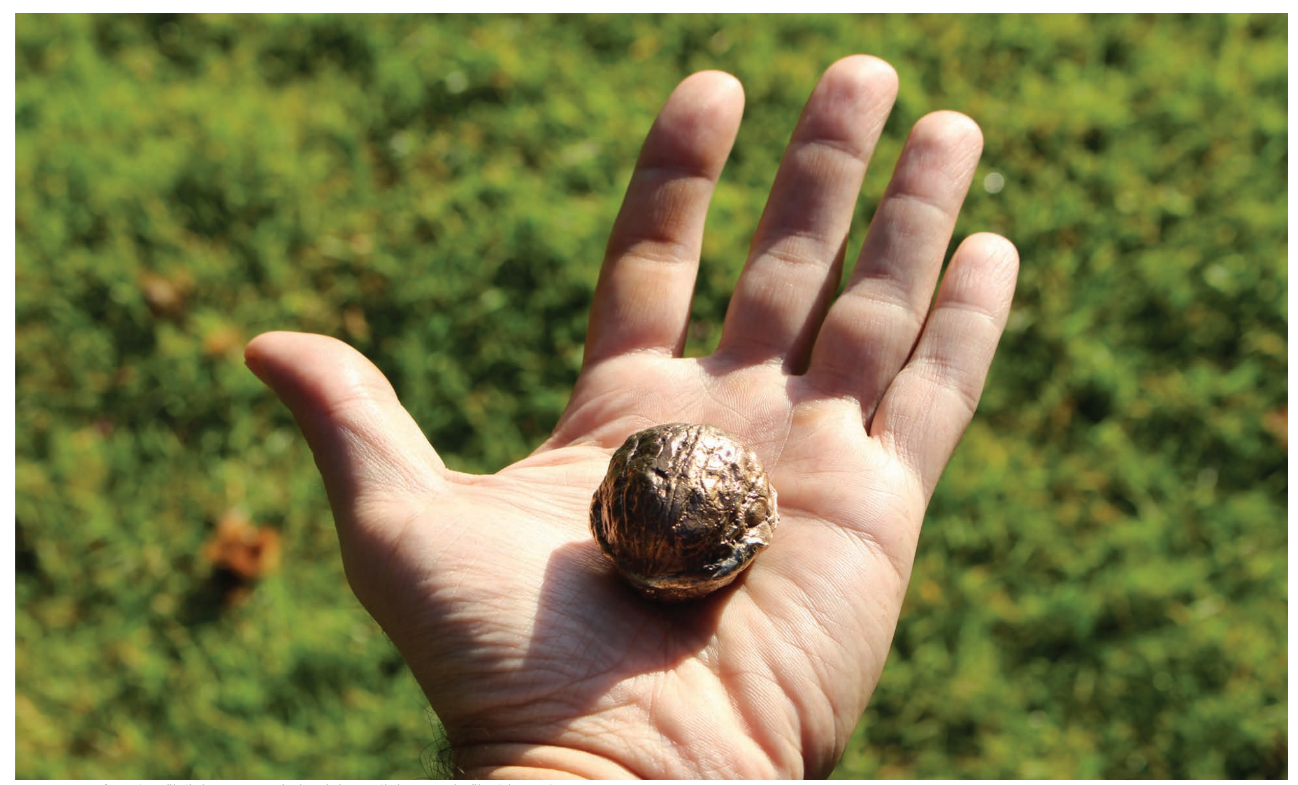
Letters to Earth, 2016 -- KölnSkulptur #9 – La Fin de Babylone -- Skulpturenpark Köln, Cologne, Germany, 2017.