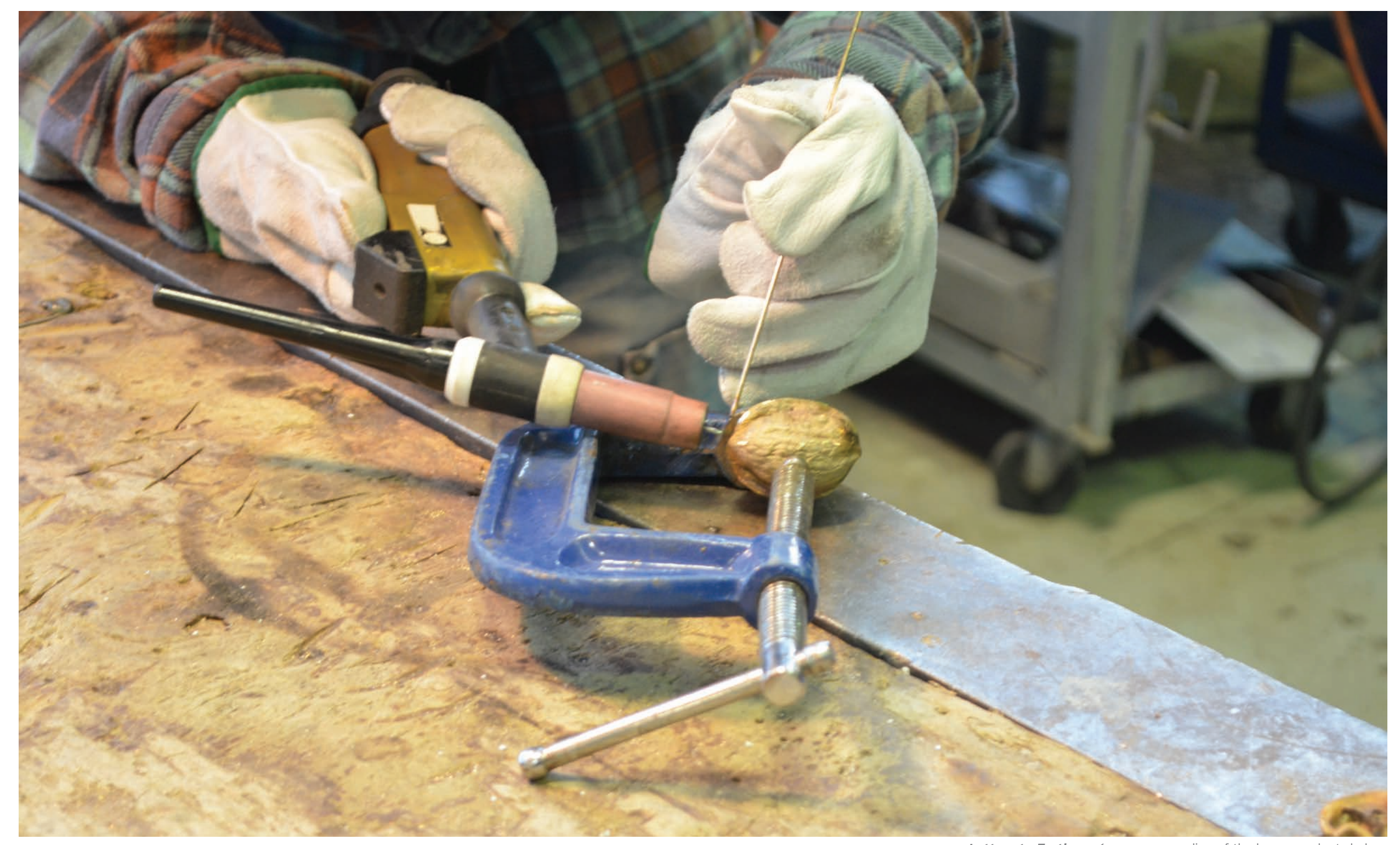
Letters to Earth , 2016 -- vacuum sealing of the bronze walnuts halves