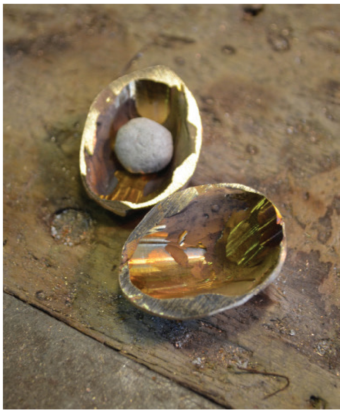
Eduardo Navarro Letters to Earth, 2016 100 nutshells made of bronze and encapsulated nutmeat variable dimmensions