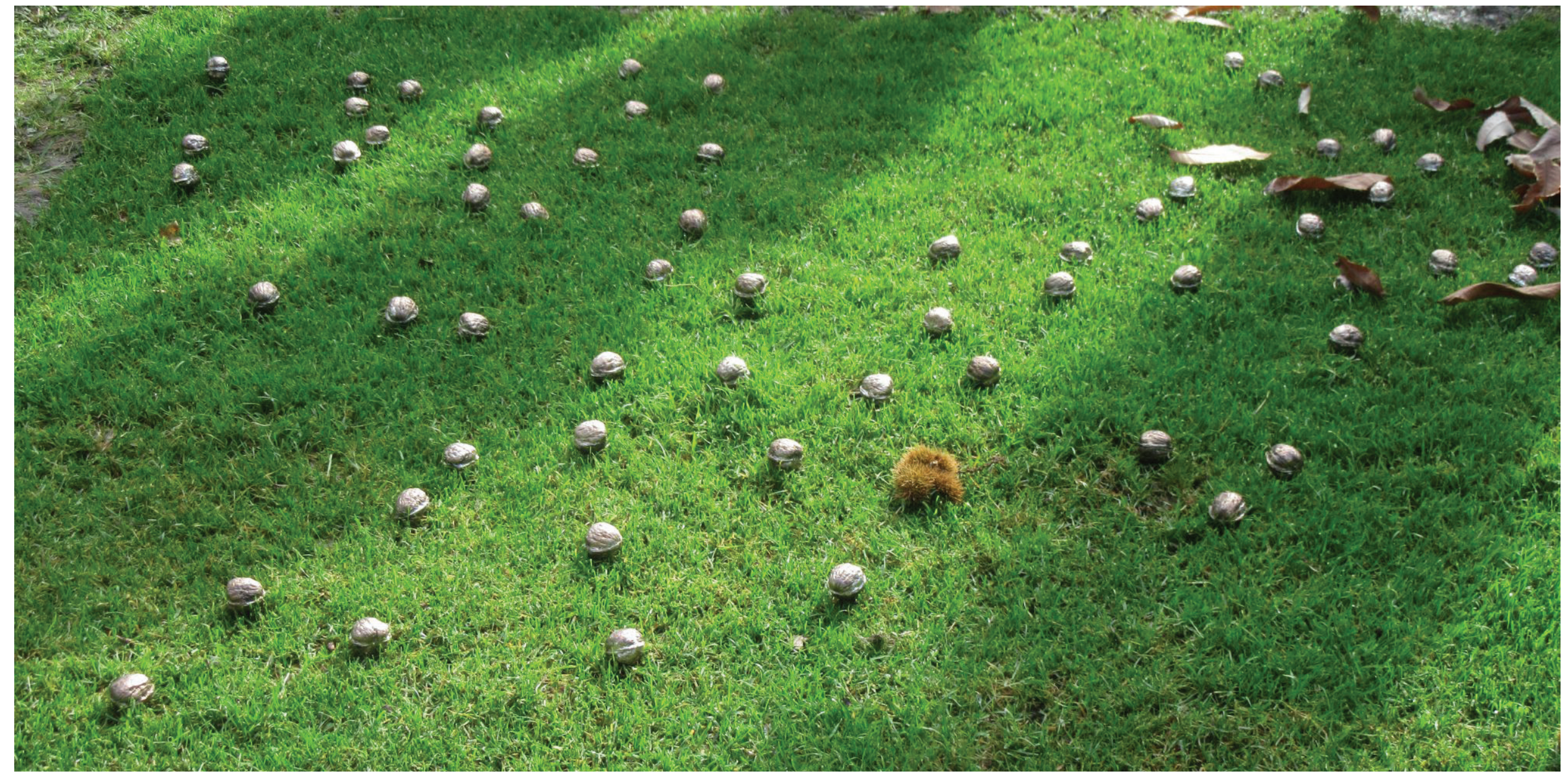
Letters to Earth, 2016 -- KölnSkulptur #9 - La Fin de Babylone -- Skulpturenpark Köln, Germany, 2017.