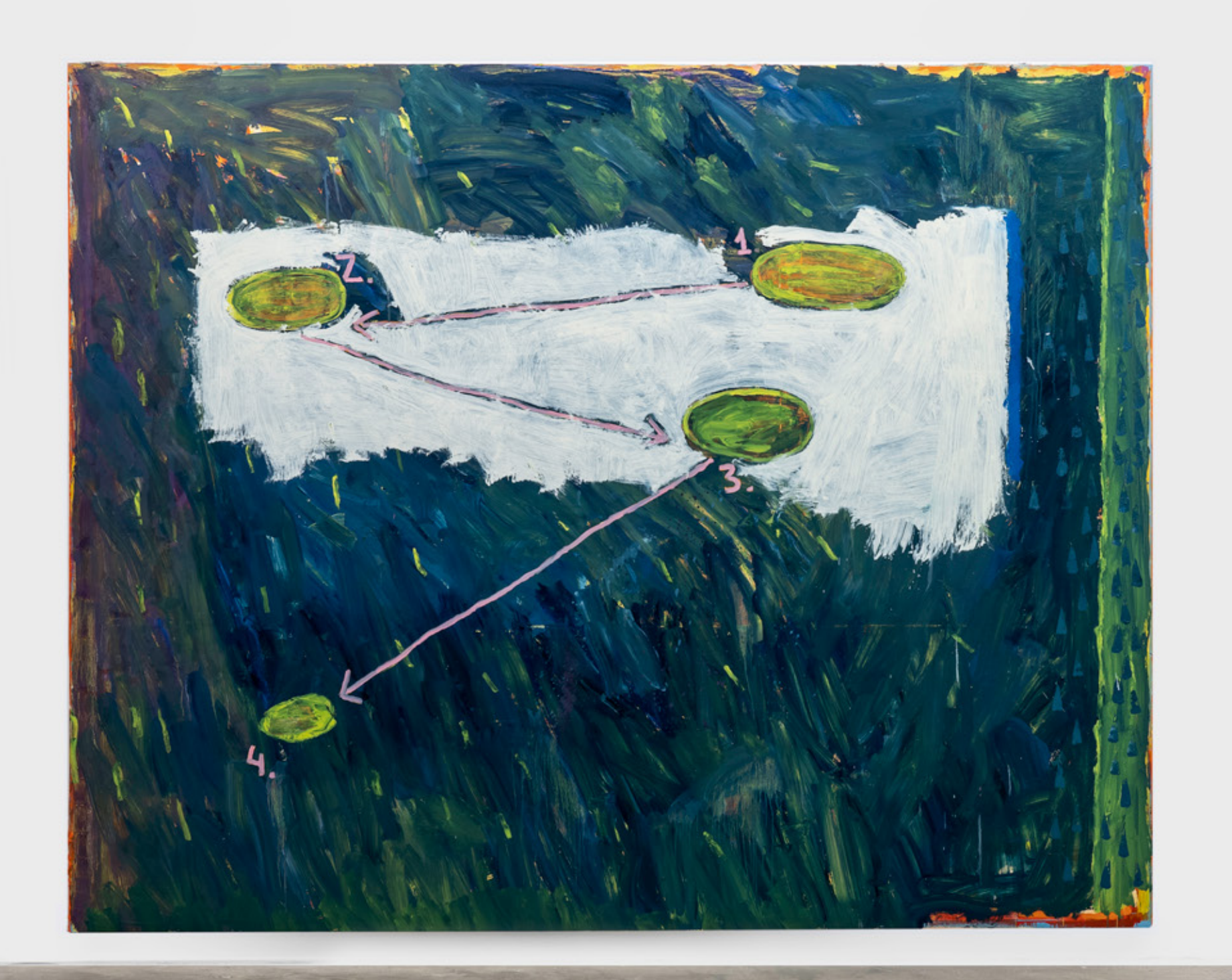
Untitled , 2019 oil paint on canvas 200 x 250 cm/78.7 x 98.4 in