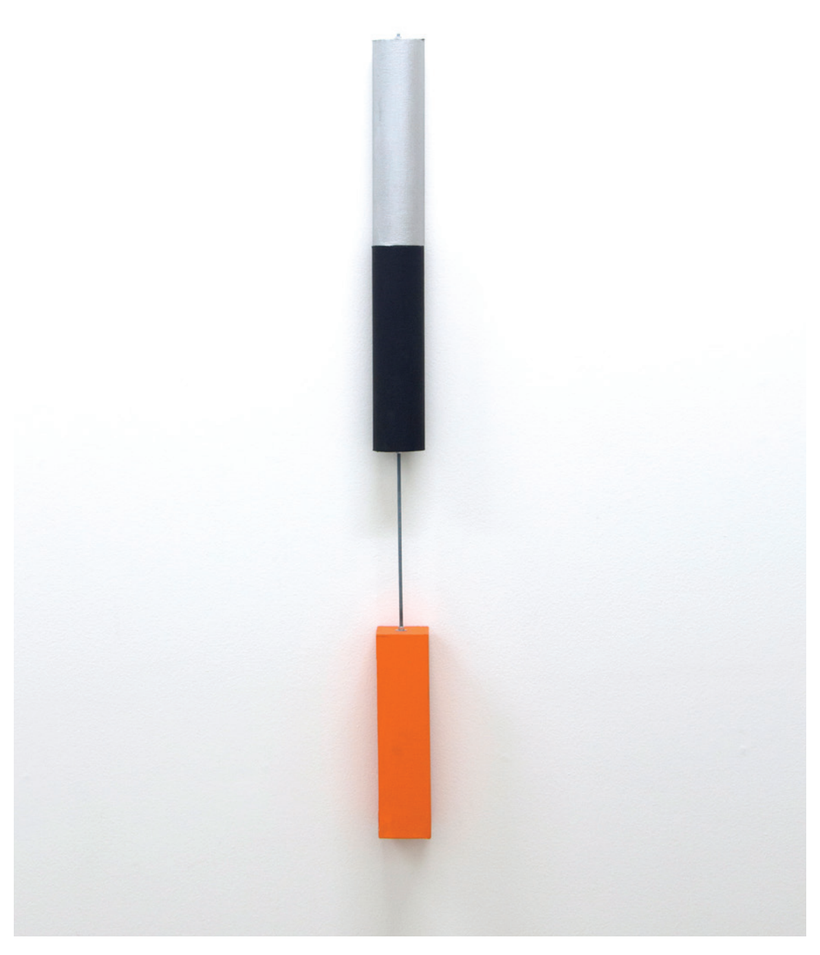
tijolo, 2017 oil on canvas, aluminum and steel cable 100 x 6,8 x 6,8 cm