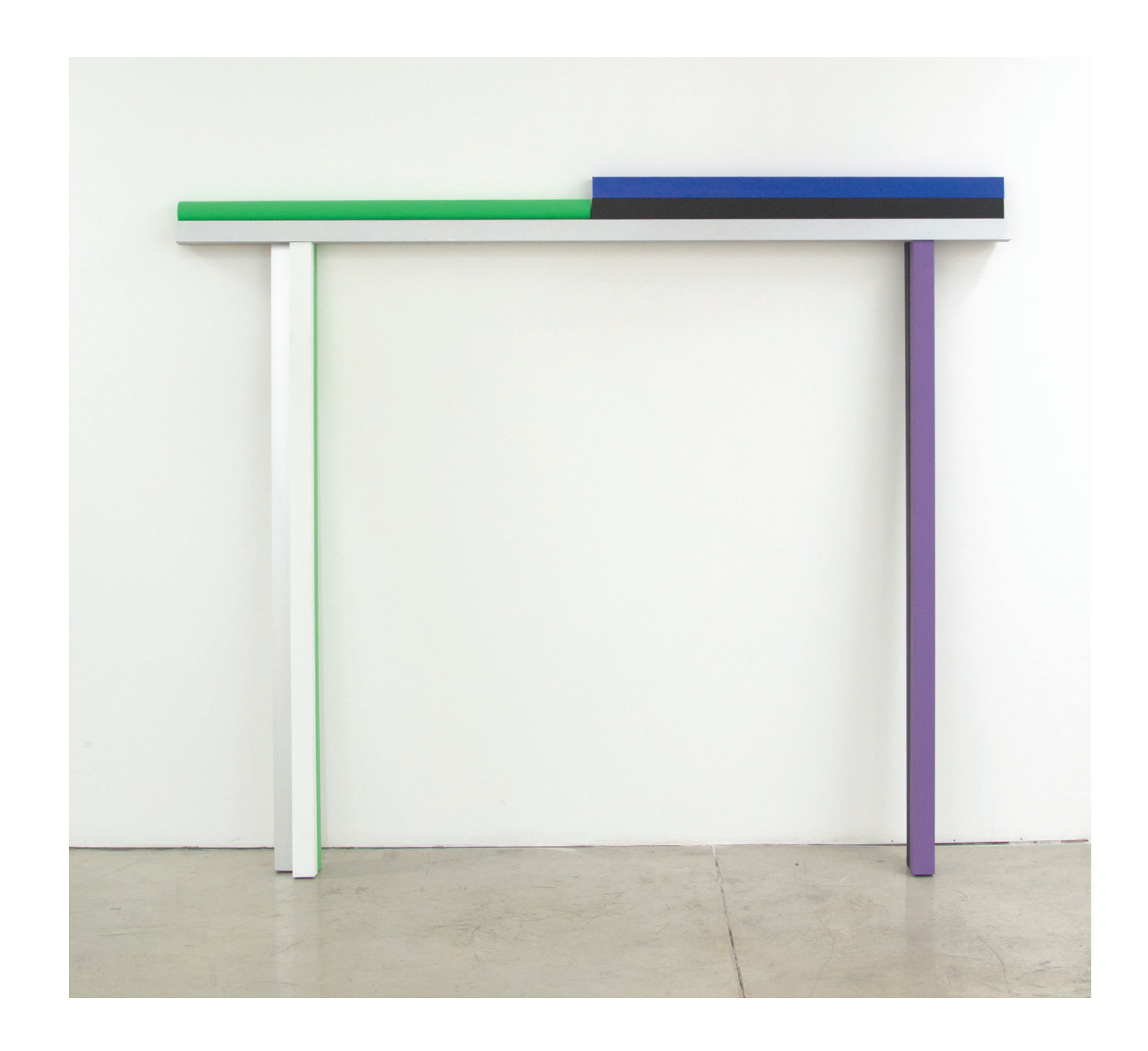
pontalete # 25, 2016 oil on canvas glued on aluminum and wood and aluminum tube 160 x 200 cm