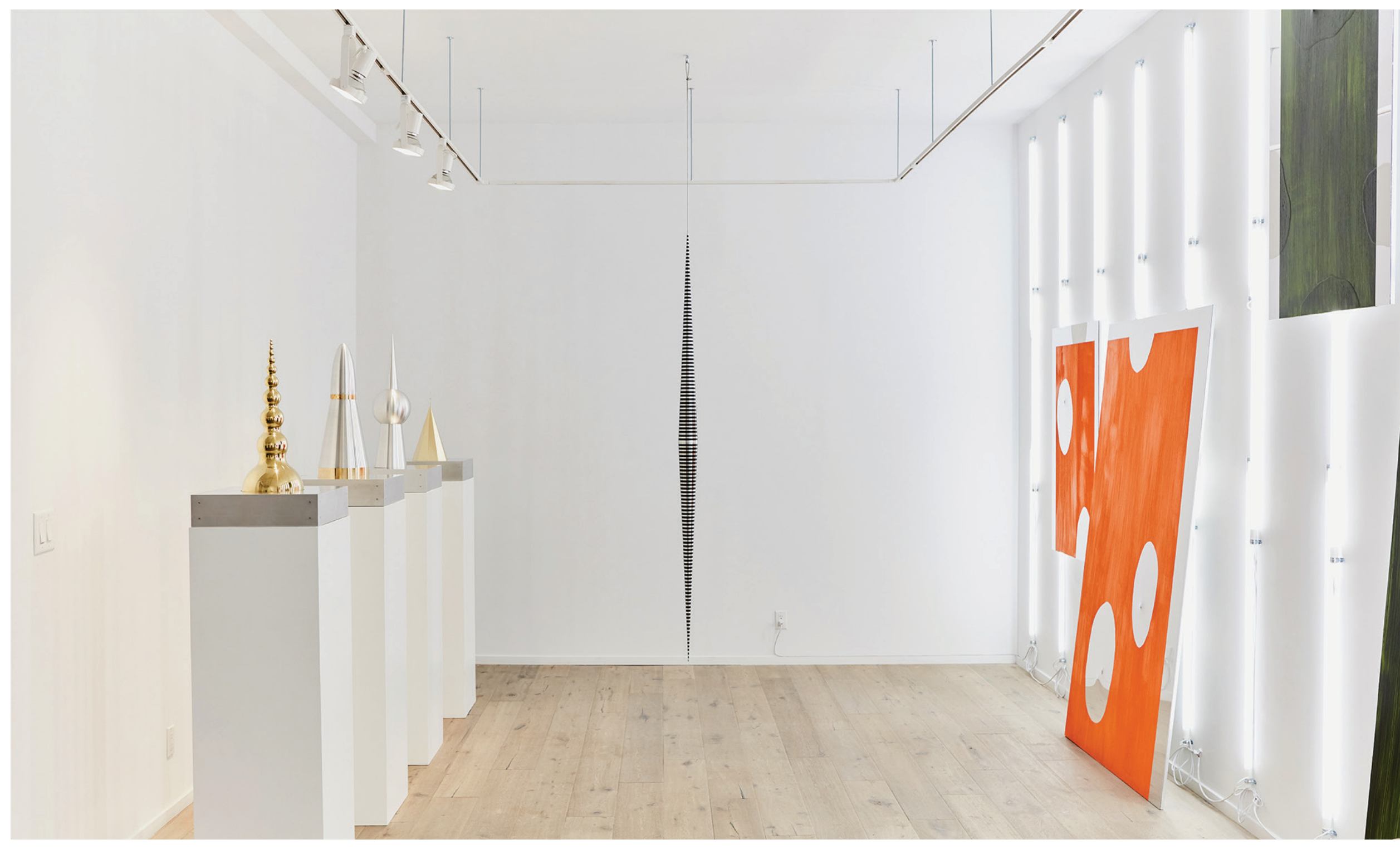
exhibition view -- galeria nara roesler | new york, 2017