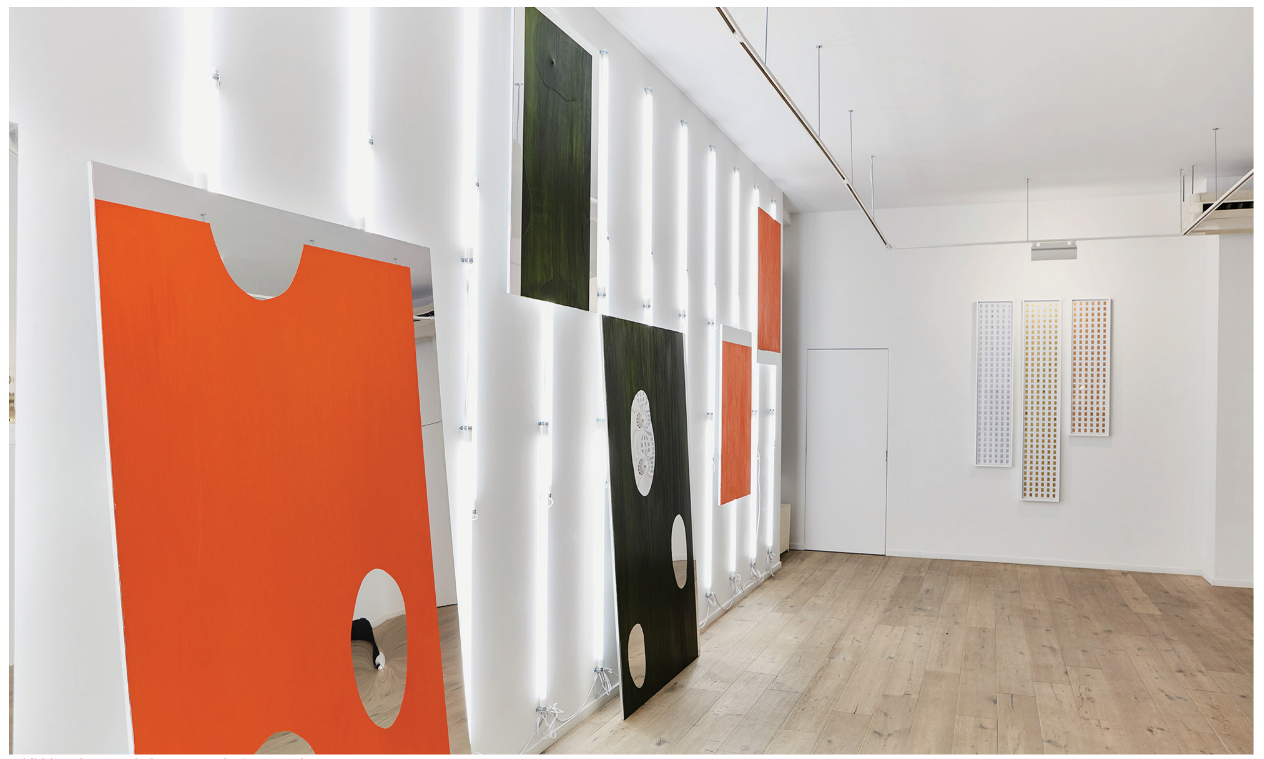
exhibition view -- galeria nara roesler | new york, 2017