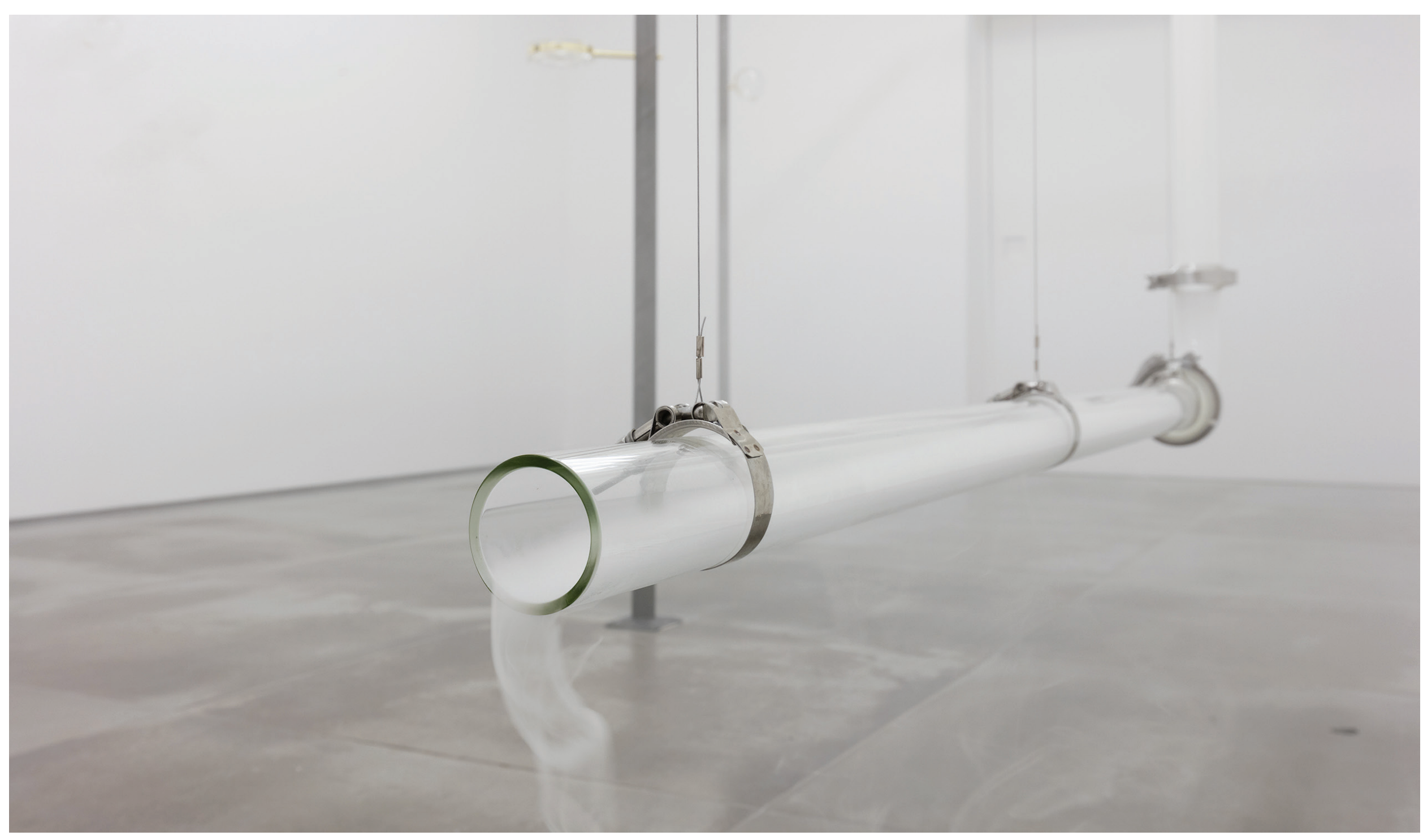
Morro Mundo , 2017 glass tube and smoke screen machine variable dimensions