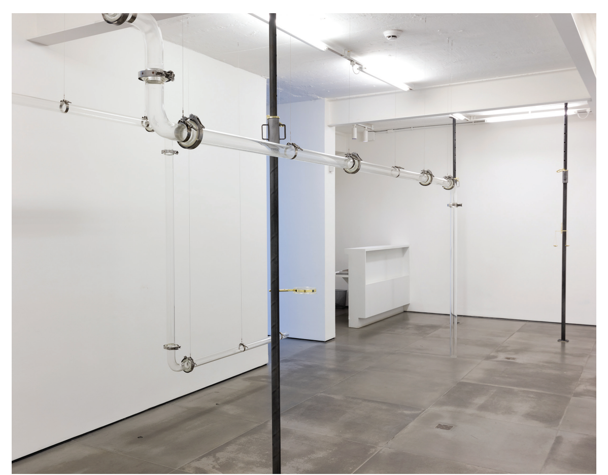
exhibition view-- galeria nara roesler | rio de janeiro, 2017

The installation's machine is programmed to release smoke as its presence sensors are activated, revealing itself to spectators via glass tubes that stretch throughout the entire exhibition space. Unlike other works that utilize vapor, such as the one the artist presented at MuBE and Beco do Pinto in São Paulo, in this installation the vapor is announced before it disperses in the air. As such, visitors can watch the smoke in a situation of control, before being engulfed in it.