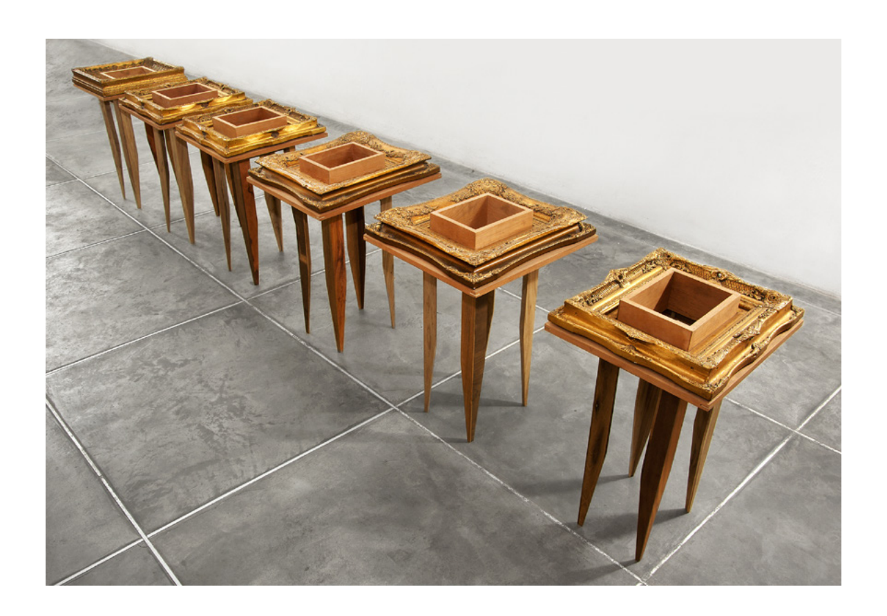
Faz de conta, 2012/2016 wood, gesso, and golden frames -- 70 x 40 x 40 cm each