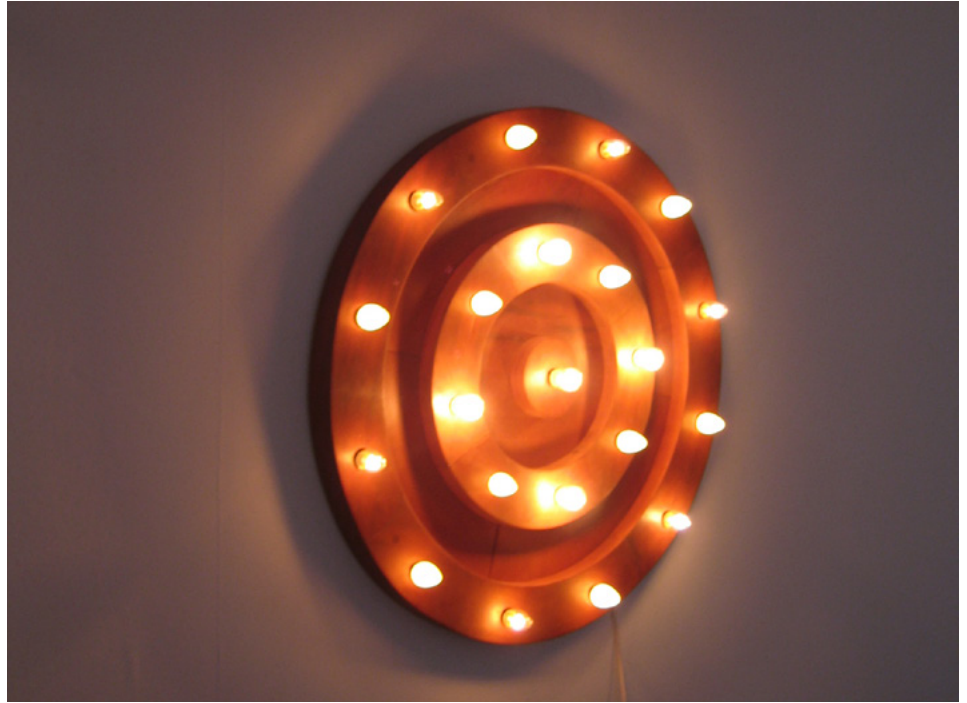
Luminosos (estrela e alvo), 2008 wood, light bulbs and electrical energy -- variable dimensions