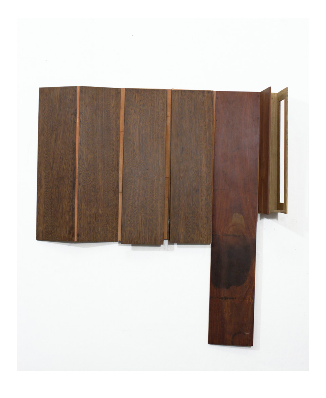
Molengas , 2016 various types of wood, goat leather -- variable dimensions