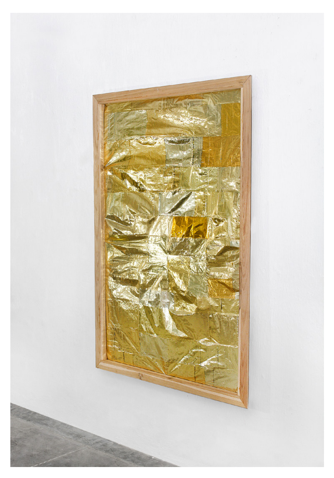
Com fé, 2013/2016 wood, thread, and coffee packages -- 158 x 100 cm each