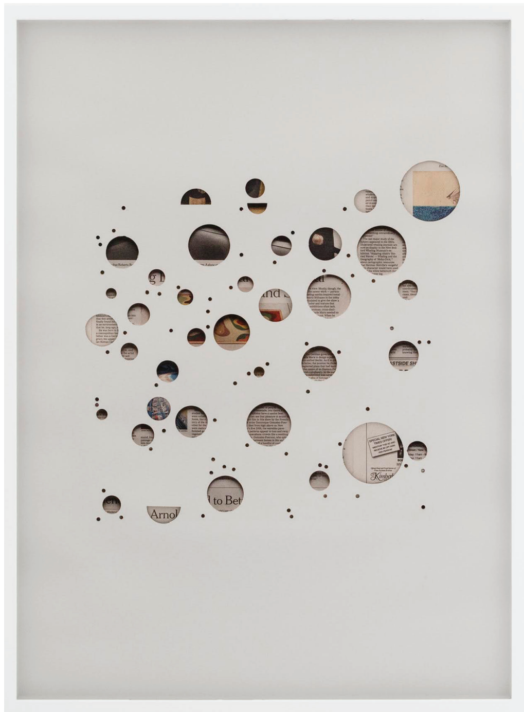
handmade: untitled (circles & newspaper), 2016 mixed media on archival inkjet print -- 75 x 55 cm

cover image two nails, 1987/2016 gelatin silver print and nail -- 25,2 x 20,4 cm collection the museum of modern art - new york