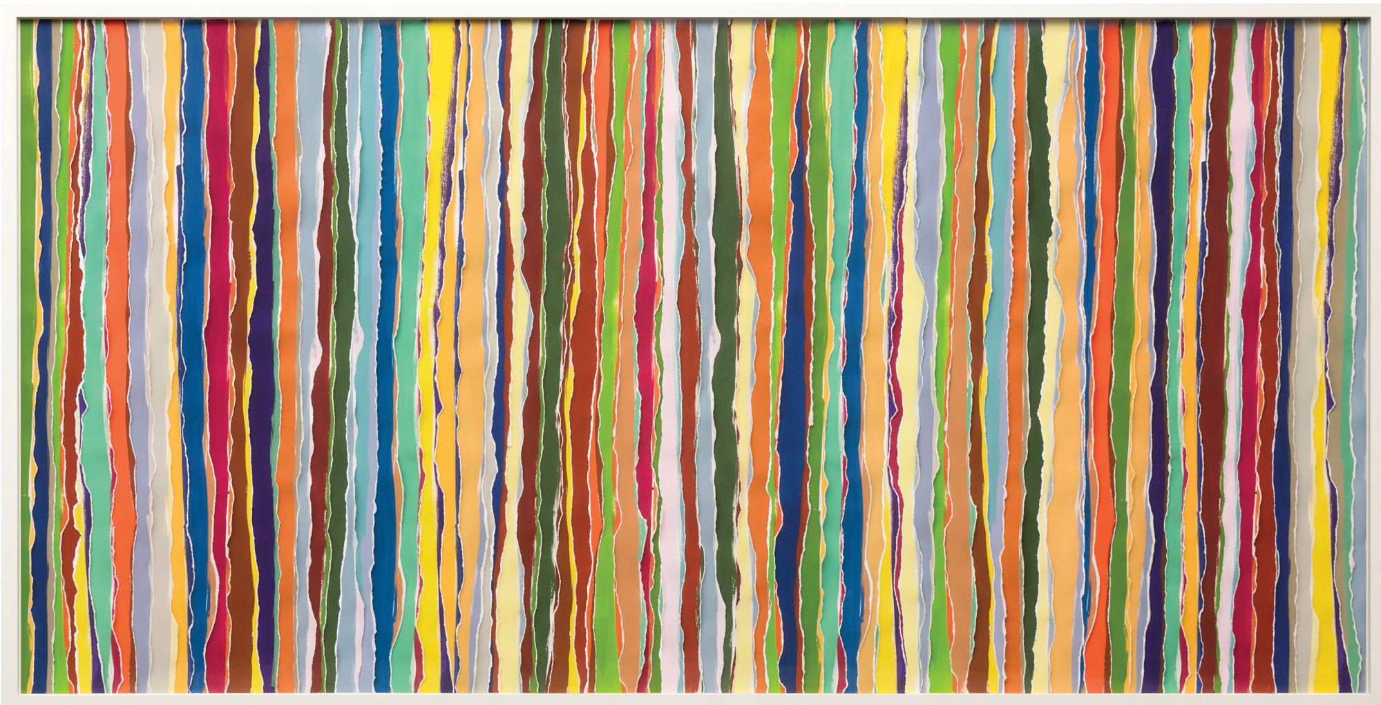
handmade: untitled (colored tears), 2016 mixed media on archival inkjet print -- 157 x 320 cm