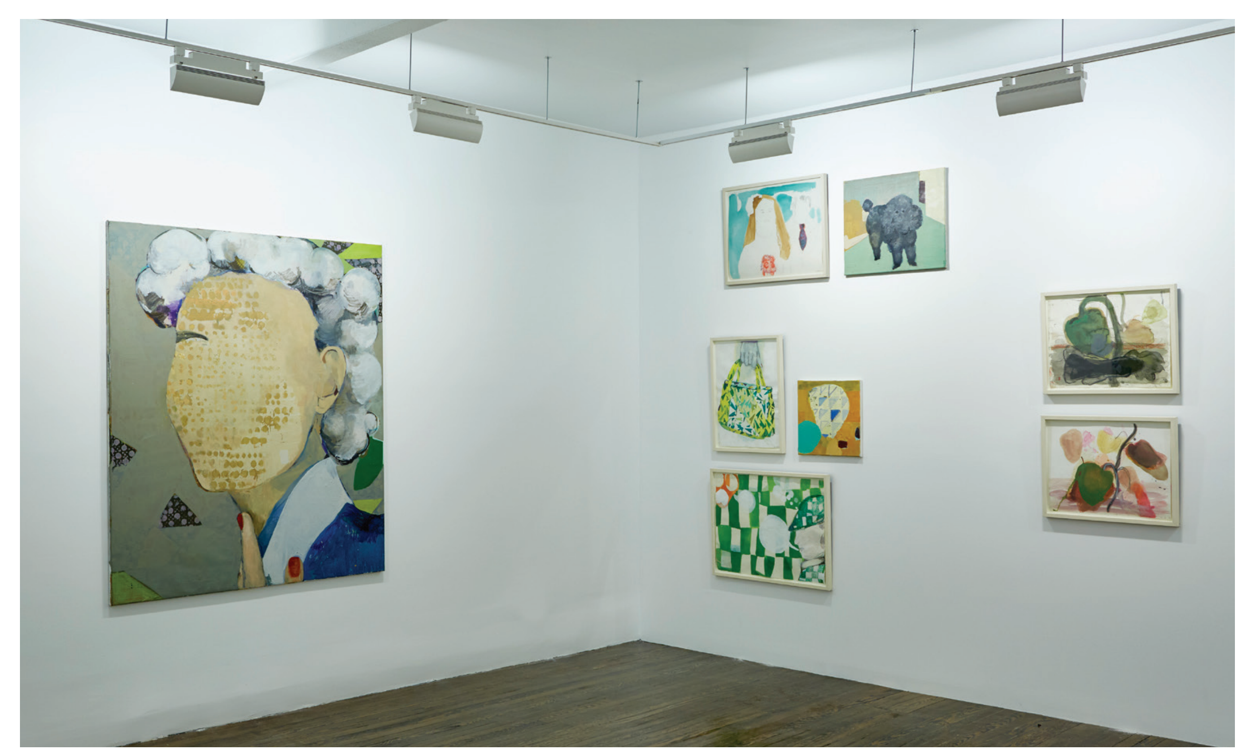
exhibition view -- galeria nara roesler | new york -- 2017