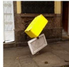
Raul Mourão 16:01:42 14/01/2013 ( Bólide/Parangolé/Selarón ) in series Timeline , 2013 mineral pigment on photographic cotton paper 34 x 34 cm

press office agência guanabara t 55 (11) 3062 6399a diego sierra diego@agenciaguanabara.com.br laila abou laila@agenciaguanabara.com.br