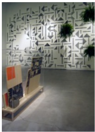
Laercio Redondo Restauro - Lembrança de Brasília, 2014 wall painting and ferns 500 x 606 cm

In 2012, the gallery created a new space for the platform for curatorial projects Roesler Hotel. Now in its 25<sup>th</sup> edition, Roesler Hotel was relaunched with Lo bueno y lo malo , curated by Patrick Charpenel (2012). Subsequent shows include Buzz , curated by Vik Muniz (2012); Hamish Fulton's ATACAMA 1234567 , curated by Alexia Tala (2013) and Cães sem plumas [prólogo] curated by Moacir dos Anjos (2013).