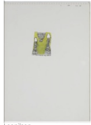
Leonilson Leo can't change the world , 1989 watercolor and black ink on paper 30.5 x 21.5 x 2.5 cm