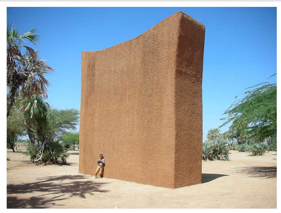
Not Vital - House to Watch the Night Skies, Aladab, Niger, 2006