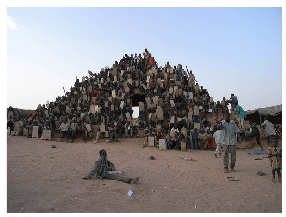
Not Vital - Makaranta (School), Agadez, Niger, 2003, Courtesy the artist, Photo Not Vital