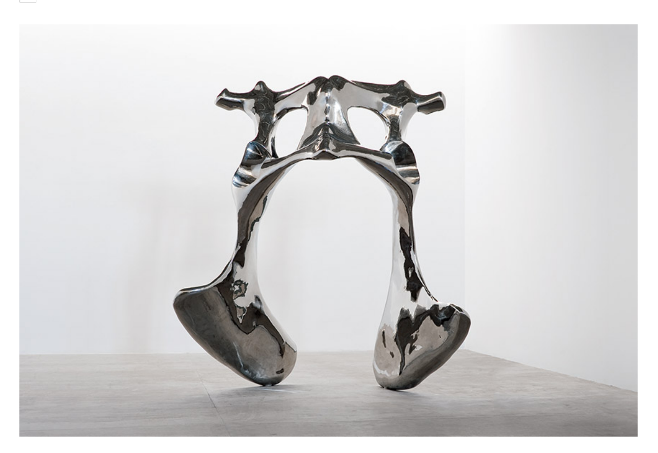
May 19, 2016