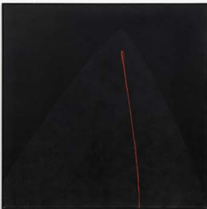
Tomie Ohtake Untitled , 1987 Oil paint on canvas 100 x 100 cm 39.4 x 39.4 in