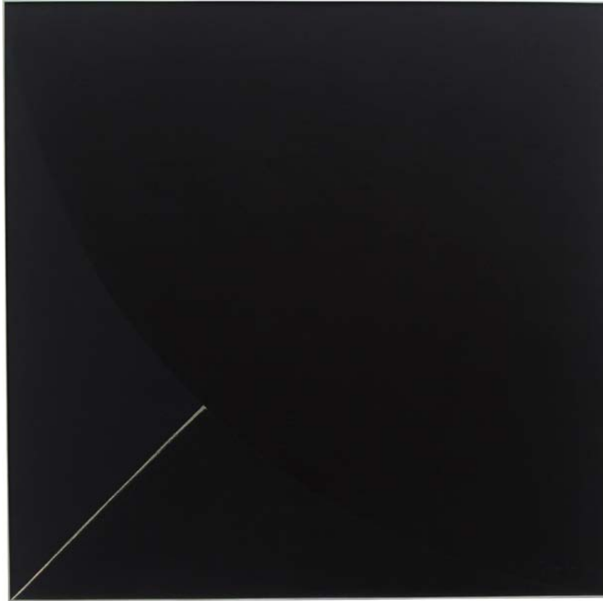
Tomie Ohtake Untitled , 1984 Acrylic paint on canvas 100 x 100 cm 39.4 x 39.4 in