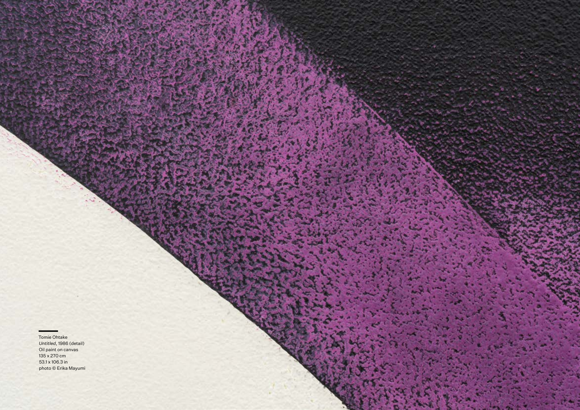
Tomie Ohtake Untitled , 1986 (detail) Oil paint on canvas 135 x 270 cm 53.1 x 106.3 in