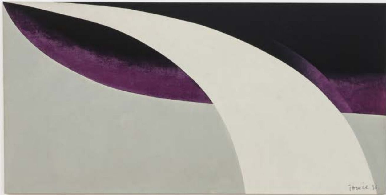
Tomie Ohtake Untitled , 1986 Oil paint on canvas 135 x 270 cm 53.1 x 106.3 in