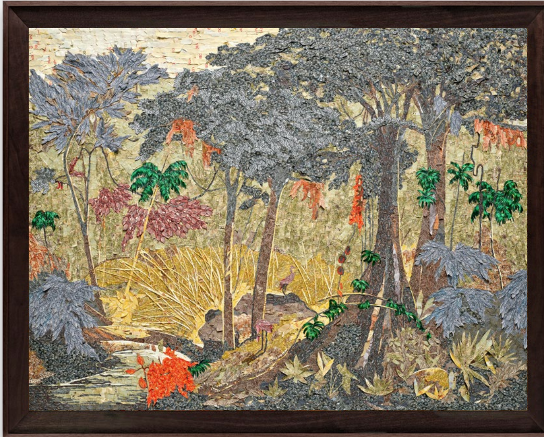
Live Cash: Mata Virgem perto de Manqueretipa, after Johann Moritz Rugendas, 2022 archival inkjet print edition of 6 + 4 AP 160 x 208,3 cm | 63 x 82 in