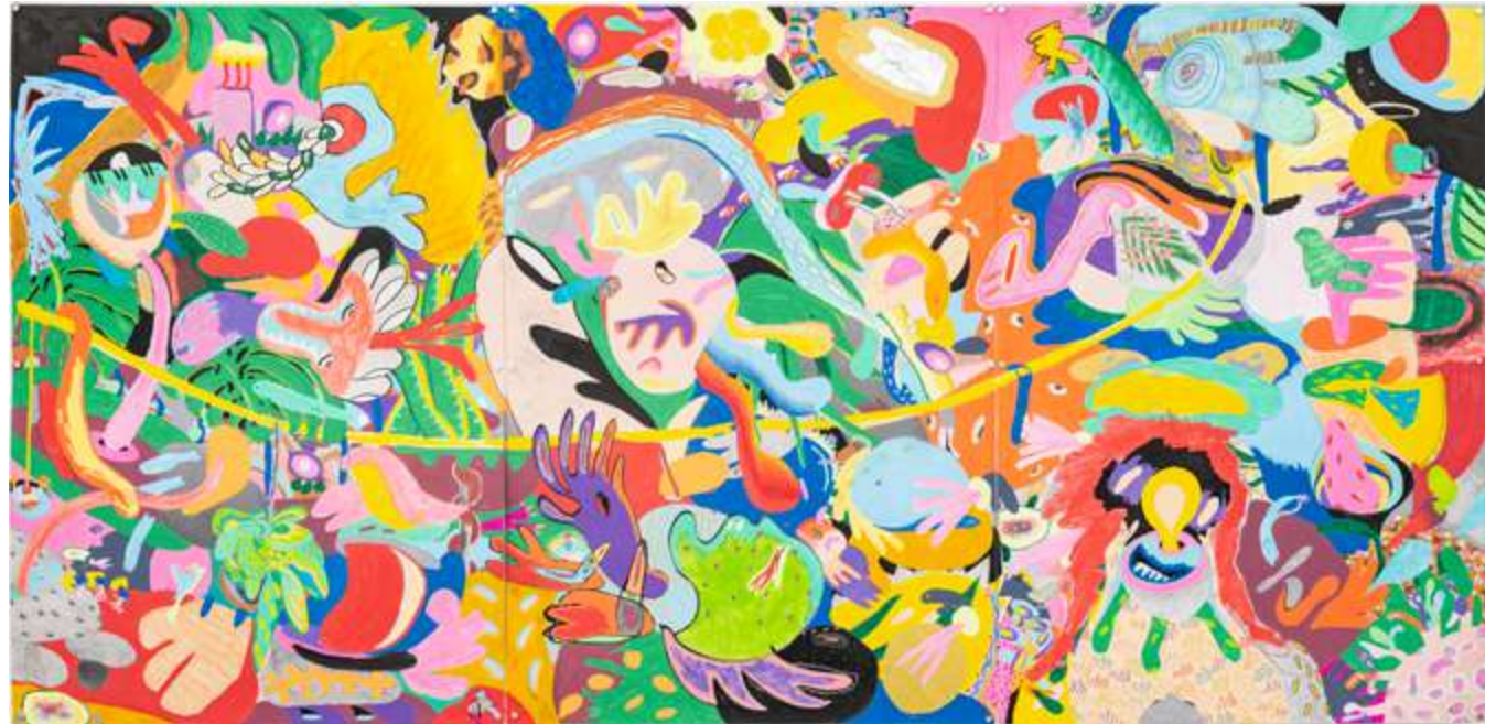
Triptico I , 2018 acrylic paint, crayons, colored pencils, graphite, ballpoint pen, permanent marker, oil pastel and spray paint on paper 240 x 120 cm | 94,5 x 47,2 in

The axis anchors the observer as they wander through the labyrinths of Barbalho's figures, and gives them attributes, such as symmetry, which governs the eloquence of his images and brings to the drawings a vertiginous character that seems to communicate with the excess of images of contemporary life, presented by the multiple canvases that surround us, while pointing to other relationships between the images and the things they represent.