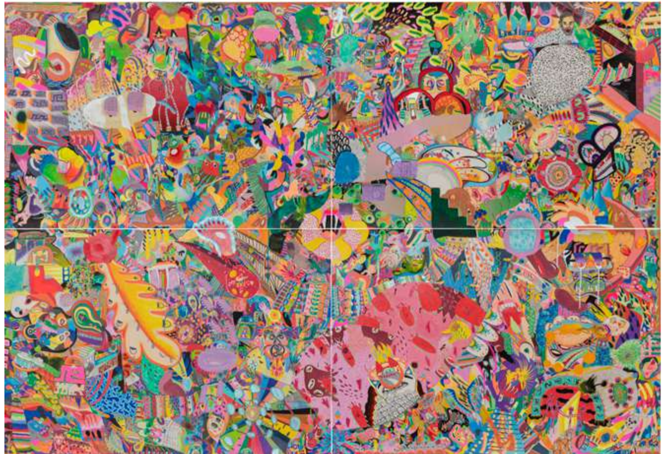
A redenção idiota , 2019 colored pencils, graphite, ballpoint pen, permanent marker, oil, pastel, acrylic and spray on paper 234 x 160 cm | 92.1 x 63 in

For Barbalho, drawing and writing have the same origin: action. They are undeniable marks left in the world that, in turn, always point to the existence of a subject who intentionally created them. They are statements by the individual. In this sense, the time taken to complete the work is a fundamental part of the process. The artist takes time to fill the entire surface of the paper with different shapes. However, unlike literature, these drawings do not build a linear narrative but instead, affirm the different temporalities that coexist in the world, creating an image that allows us to take different paths of narrative chaining as we follow Barbalho's drawings with our eyes.