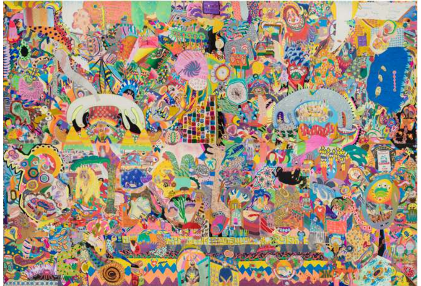
Dois louva-a-deus , 2019-2020 colored pencils, graphite, ballpoint pen, permanent marker, oil, pastel, acrylic and spray on paper 234 x 160 cm | 92.1 x 63 in

Between 2014 and 2017, the artist put aside his dedication to Eurocentric philosophy and began to dedicate himself to the study of native South American thought, until he came into contact with those who use consciousness-altering plants as a path for spiritual investigation. These experiences allowed the artist to access another repertoire of shapes that would later be integrated into his work. The artist's contrasting and sometimes fluorescent colors make for a psychedelic atmosphere that can be seen as a tribute to these experiences.