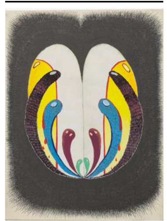
Meu guia , 2022 colored pencils, graphite, ballpoint pen and permanent marker on canvas 40 x 30 cm 15.7 x 11.8 x 0.8 in