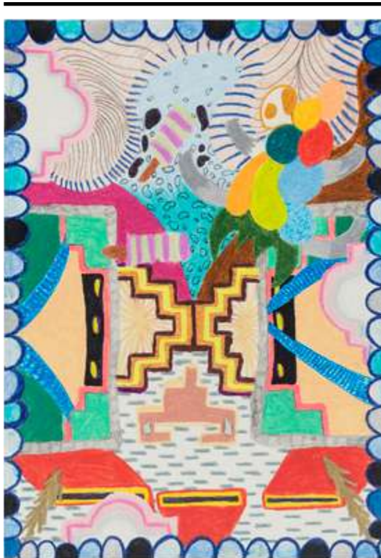
Atrás do que vi (Yarinacocha, Amazônia peruana) , 2019 colored pencils, graphite, ballpoint pen and permanent marker on paper 21 x 14 cm | 8.3 x 5.5 in