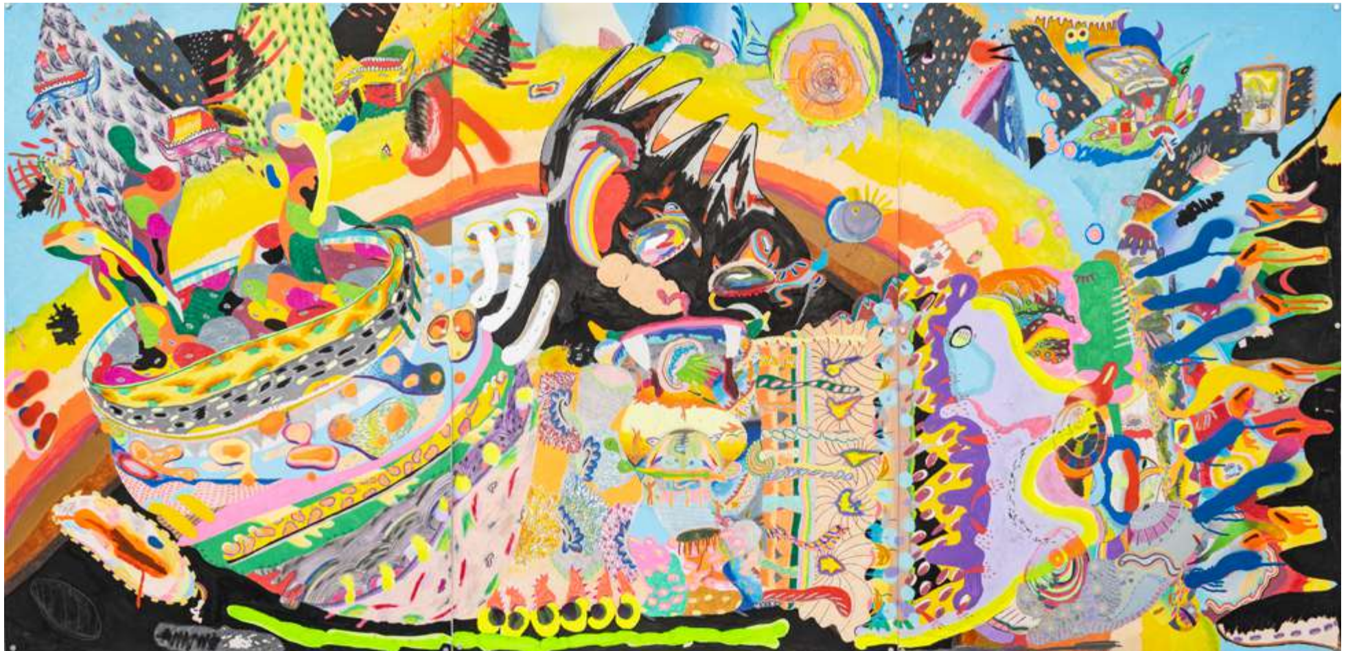
Triptico II , 2018 acrylic paint, crayons, colored pencils, graphite, ballpoint pen, permanent marker, oil pastel and spray paint on paper 225 x 120 cm | 88.6 x 47.2 in