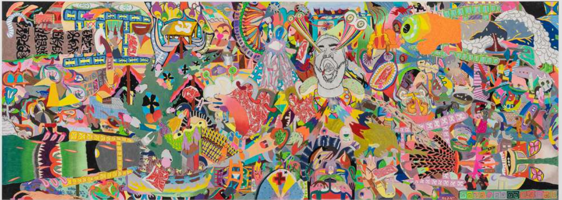
Mamabanha , 2021/2022 colored pencils, graphite, pastel, ballpoint pen, permanent marker, acrylic, oil and spray on paper 27.6 x 78.7 in