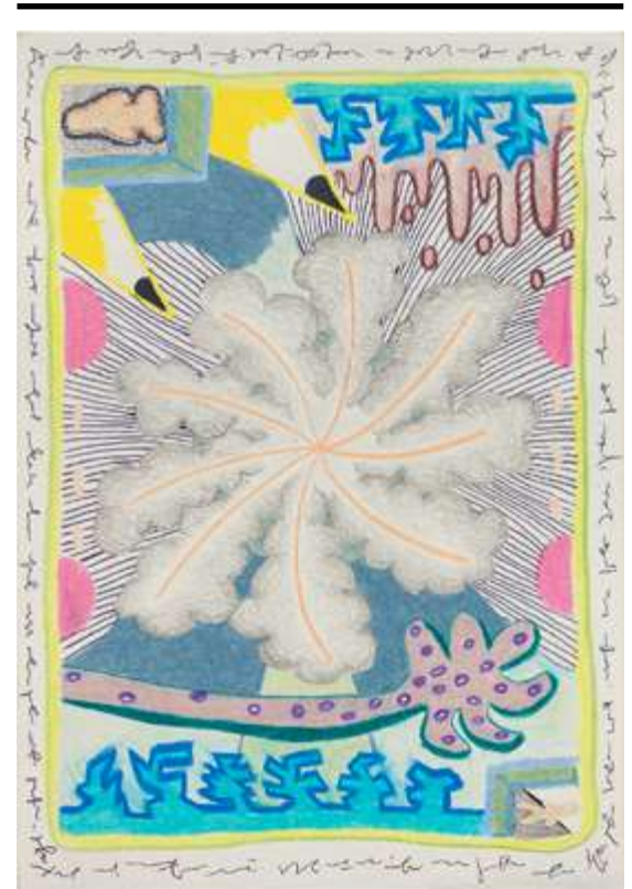
Atrás do que vi (Yarinacocha, Amazônia peruana) , 2019 colored pencils, graphite, ballpoint pen and permanent marker on paper 21 x 14 cm | 8.3 x 5.5 in