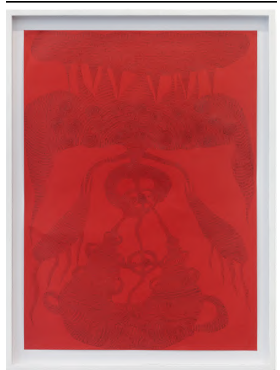
Instante IV, 2018 graphite pencil on colored paper 47,5 x 65 cm | 18.7 x 25.6 in

Gradually, these sets of strokes, whose intervals, thickness and size create different visual rhythms, are able to provide a richness of textures that break with the supposed monotony of the process. The organic, rounded shapes are also a counterpoint to the rationality of the process, as they were not planned by the artist but rather, happened organically during the creative process based on the small decisions Barbalho made with each new step.