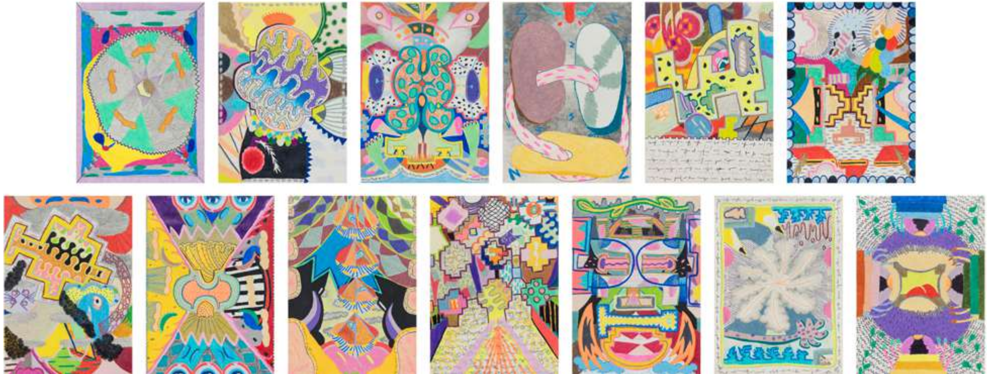
Atrás do que vi (Yarinacocha, Amazônia peruana) , 2019 colored pencils, graphite, ballpoint pen and permanent marker on paper 16 parts of 21 x 14 cm | 8.3 x 5.5 in