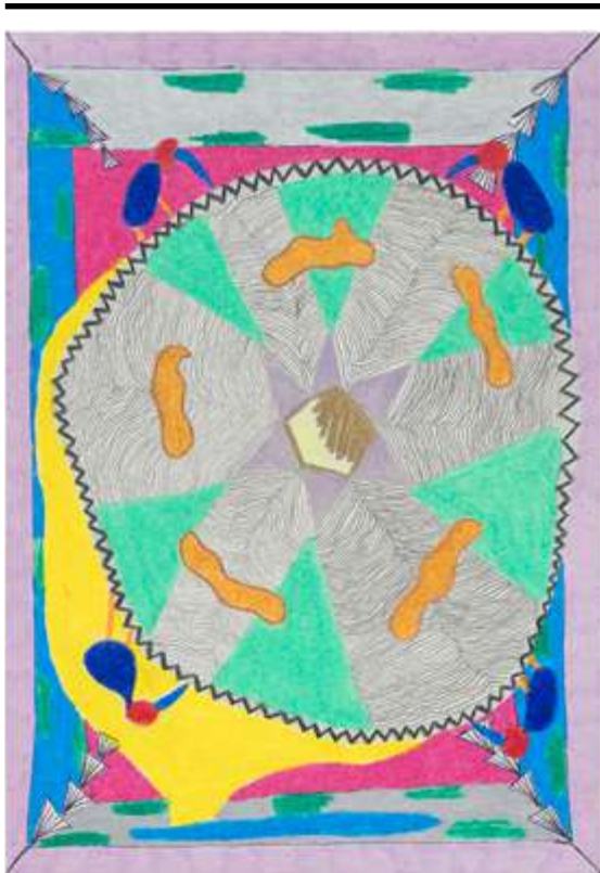
Atrás do que vi (Yarinacocha, Amazônia peruana) , 2019 colored pencils, graphite, ballpoint pen and permanent marker on paper 21 x 14 cm | 8.3 x 5.5 in