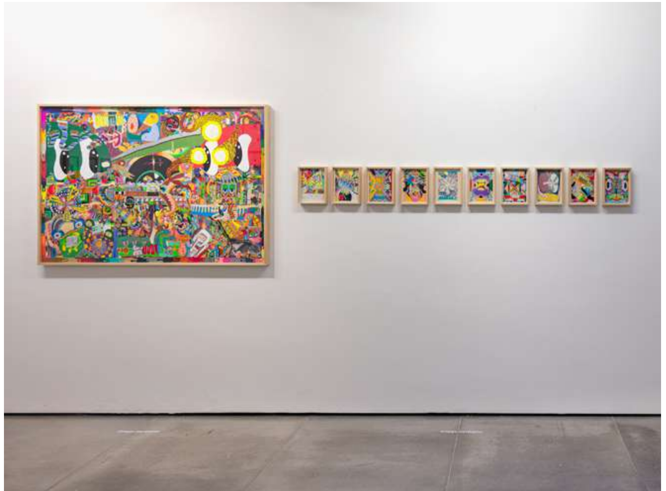
exhibition view Electric Dreams , 2021 Nara Roesler Rio de Janeiro Rio de Janeiro, Brazil

When viewing the drawings up close, the viewer can see that the small shapes look like inscriptions, or a particular kind of vocabulary, revealing to us the proximity between writing and drawing, a relationship which often finds itself at the foundation of Barbalho's practice.