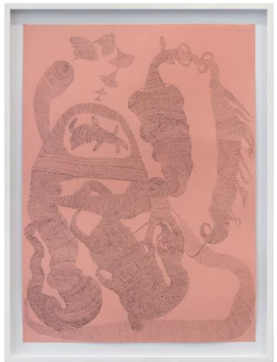
Instante I, 2018 graphite pencil on colored paper 47,5 x 65 cm | 18.7 x 25.6 in