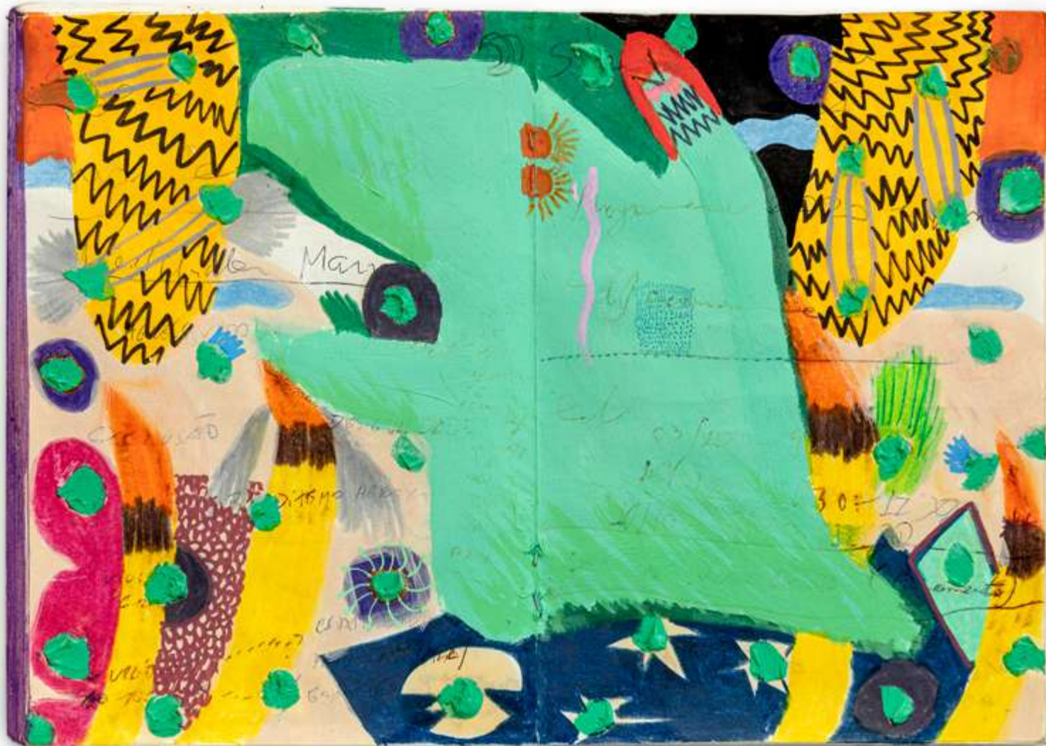
Caderninho V (Paranoia), 2020 colored pencils, graphite, ballpoint pen, permanent marker, crayons and spray on paper 15 x 20 cm | 5.9 x 7.9 in