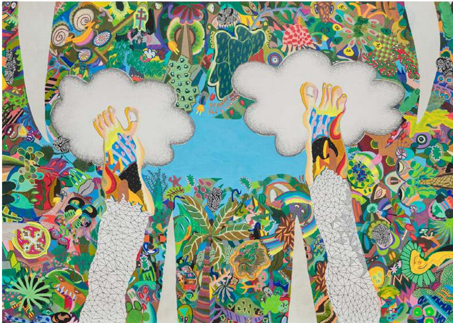
De pernas pro ar (sendo engolido) , 2020 graphite, colored pencils, ballpoint pen, permanent marker, acrylic and oil on paper 72 x 101 cm | 28.3 x 39.8 in