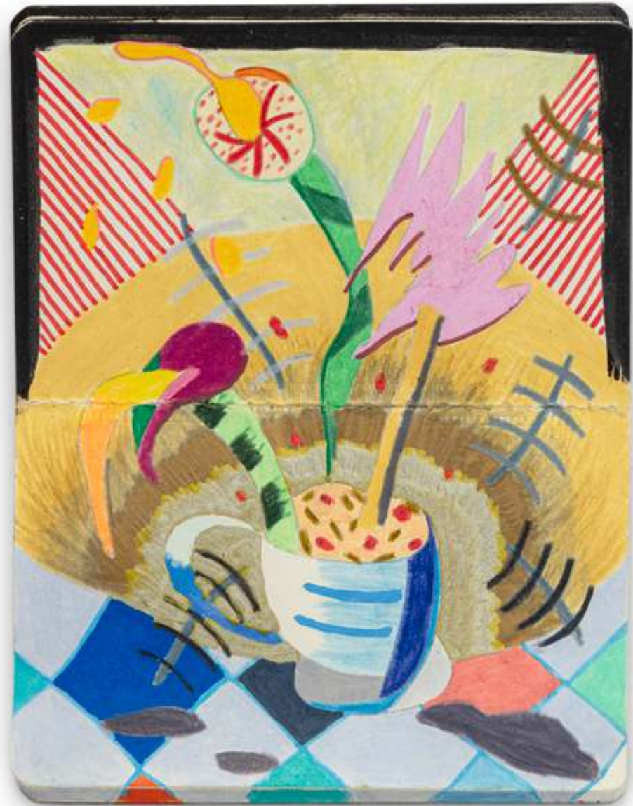
Caderninho VI , 2021 colored pencils, graphite, ballpoint pen, permanent marker, crayons and spray on paper 15 x 20 cm | 5.9 x 7.9 in

Thiago Barbalho's drawings also take place in the intimacy of his notebooks. This practice, common to many artists, allows for the hand to move freely and also for more casual experimentation. Sometimes, a drawing can be formed in a more incisive way that is more attuned in form and material qualities. Paranoia (2019) is exemplary in this regard. Barbalho selected the drawing that he thought was worthy of being shared with the public and framed it without detaching its stand. In this way, the artist respects the process and the work's original stand, leaving the other drawings dormant under the one on view.