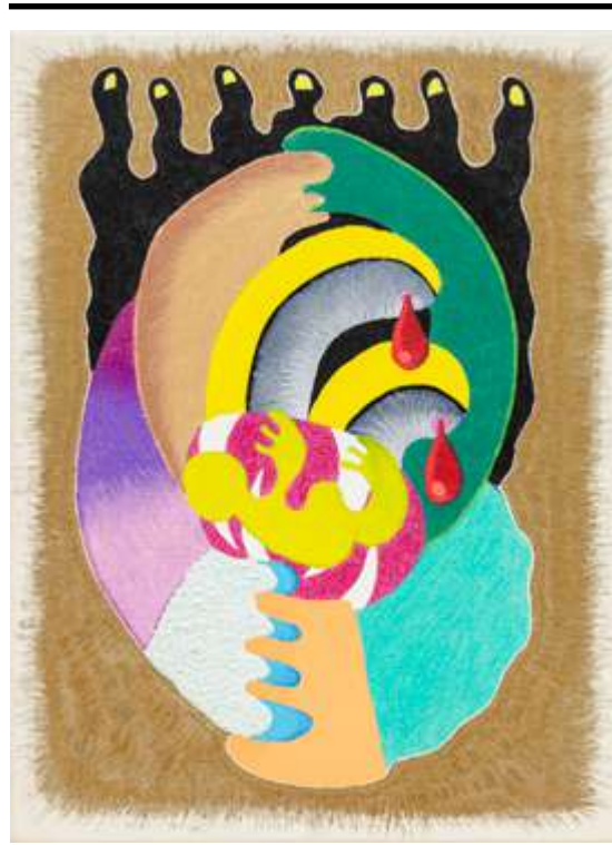
Mãinha muito voraz , 2022 colored pencils, graphite, ballpoint pen and permanent marker on canvas 40 x 30 x 2 cm 15.7 x 11.8 x 0.8 in