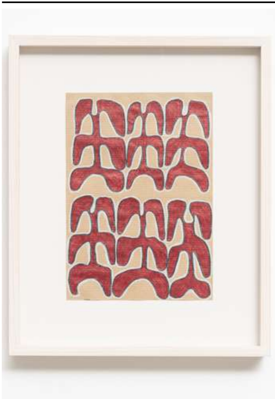
Figures harvesting cotton (Countryside XIII), 2024 colored pencil and ballpoint pen on paper 21 x 15 cm 8.3 x 5.9 in