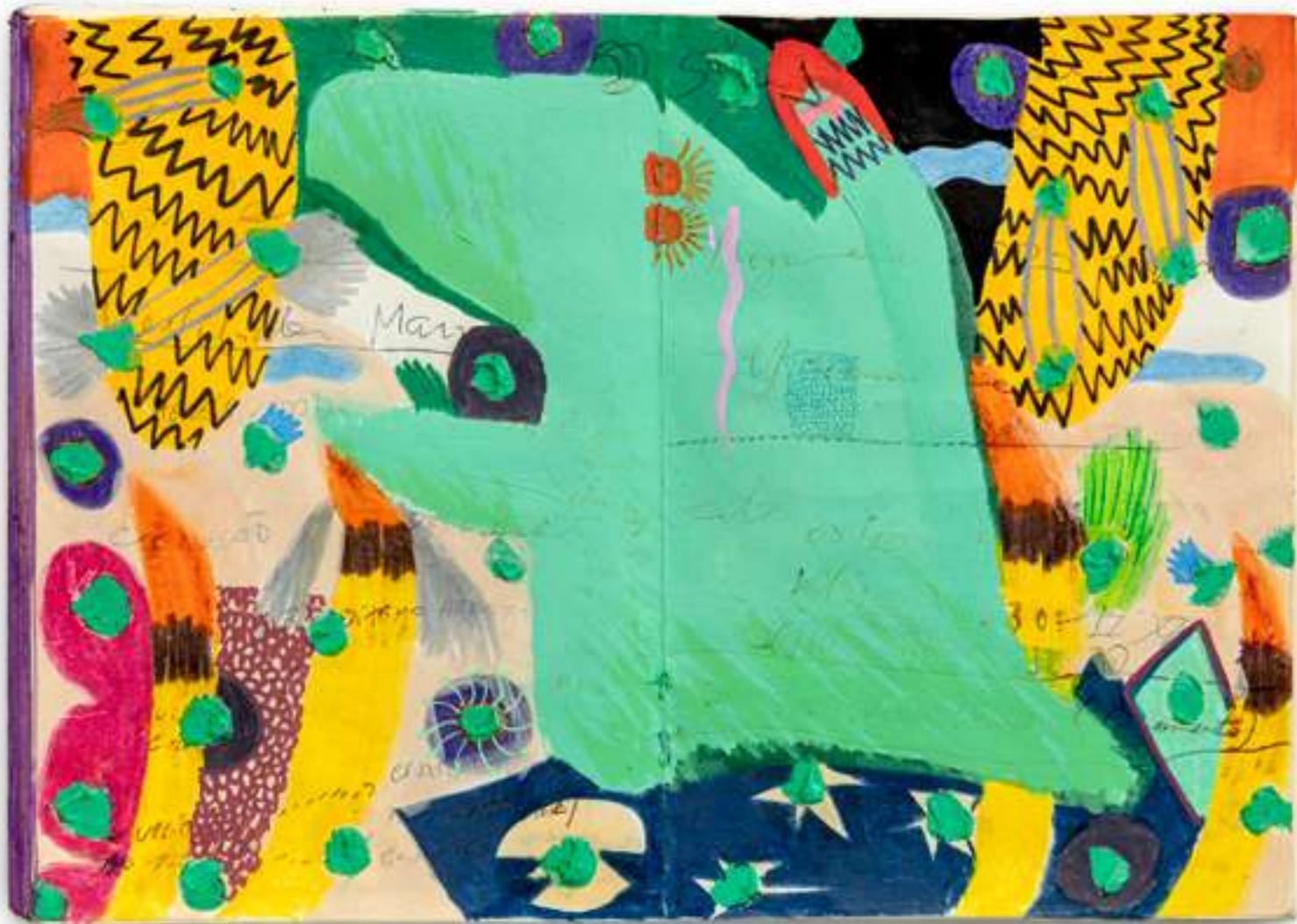
Caderninho V (Paranoia) , 2020 colored pencils, graphite, ballpoint pen, permanent marker, crayons and spray on paper 15 x 20 cm | 5.9 x 7.9 in