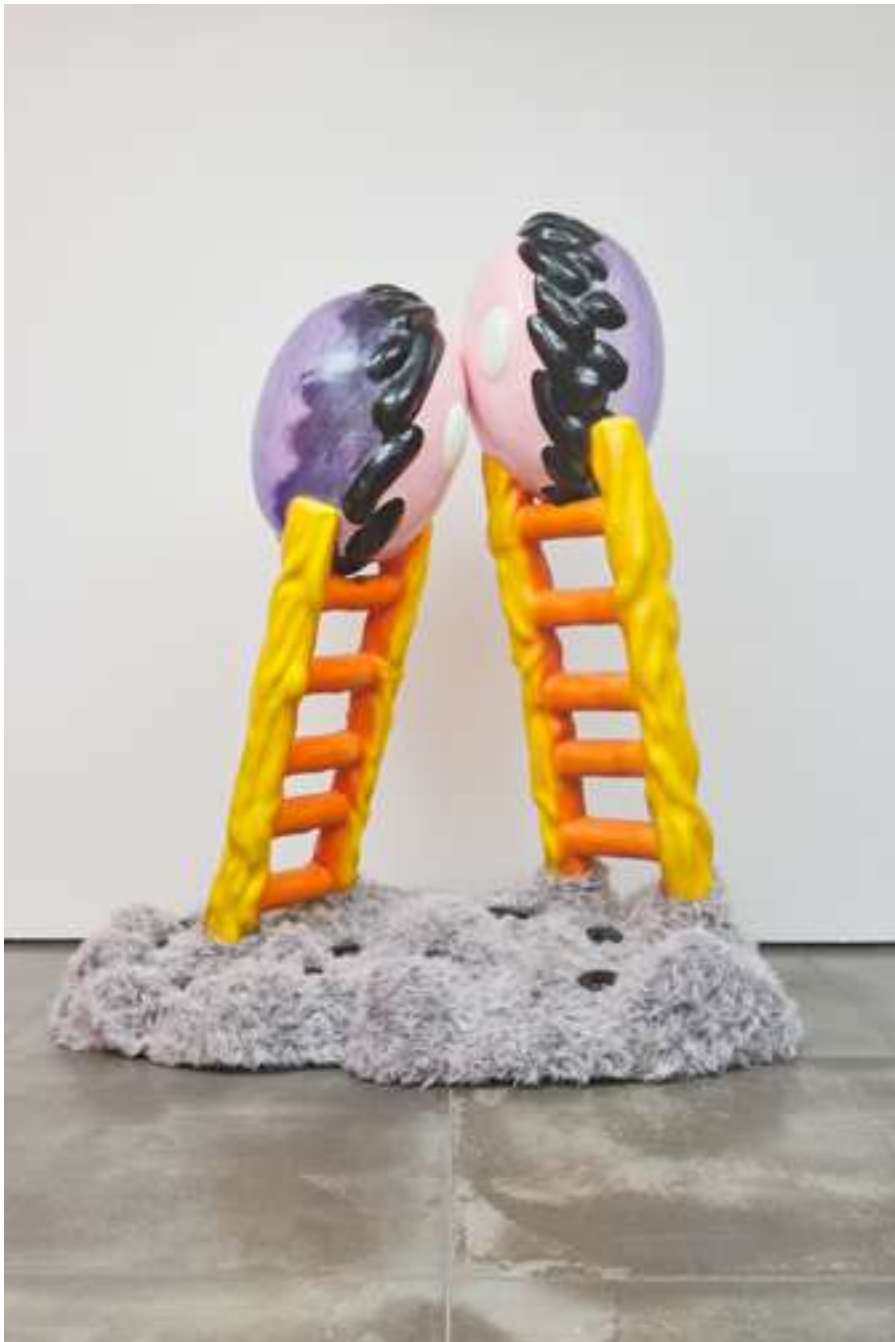
Gonads , 2022 structural styrofoam, fiberglass, 3D printing, crystal resin, pigment and automotive paint 73.6 x 70.5 x 43.3 in

→ exhibition view Depois que entra ninguém sai , 2022 Nara Roesler, Rio de Janeiro, Brazil