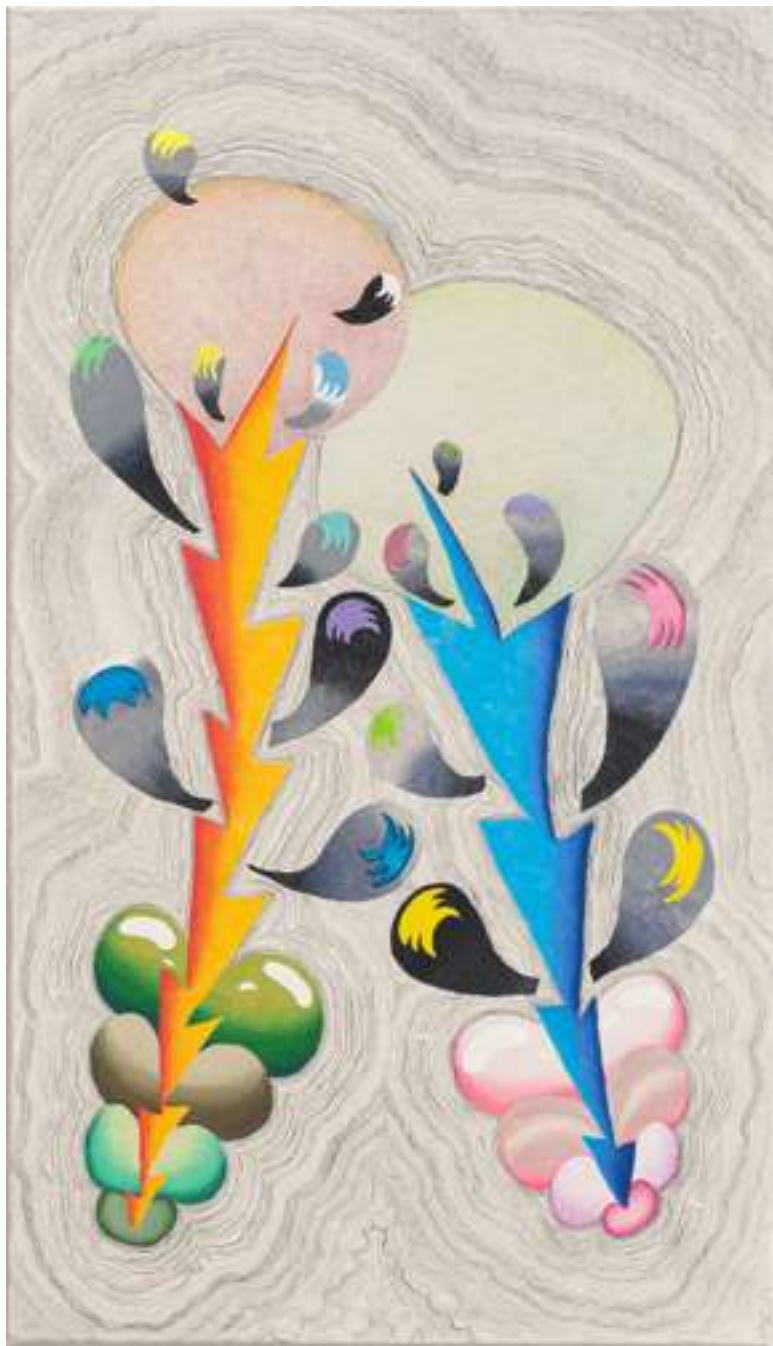
Caboclos of the woods , 2025 colored pencil, graphite pencil, ballpoint pen, oil paint and permanent marker on canvas 150 x 80 cm 59.1 x 31.5 in