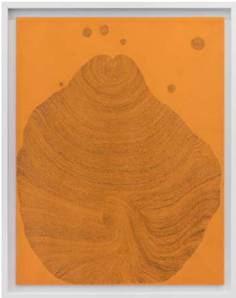
Instante XII, 2018 graphite pencil on colored paper 47,5 x 65 cm | 18.7 x 25.6 in