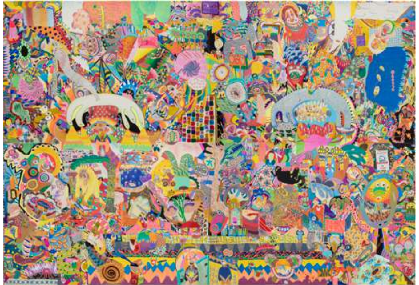
Dois louva-a-deus , 2019-2020 colored pencils, graphite, ballpoint pen, permanent marker, oil, pastel, acrylic and spray on paper 234 x 160 cm | 92.1 x 63 in

Between 2014 and 2017, the artist put aside his dedication to Eurocentric philosophy and began to dedicate himself to the study of native South American thought, until he came into contact with those who use consciousness-altering plants as a path for spiritual investigation. These experiences allowed the artist to access another repertoire of shapes that would later be integrated into his work. The artist's contrasting and sometimes fluorescent colors make for a psychedelic atmosphere that can be seen as a tribute to these experiences.