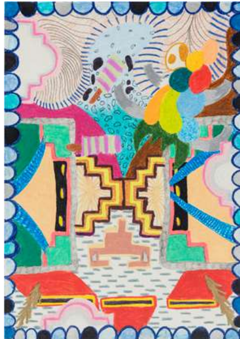
Atrás do que vi (Yarinacocha, Amazônia peruana), 2019 colored pencils, graphite, ballpoint pen and permanent marker on paper 21 x 14 cm | 8.3 x 5.5 in