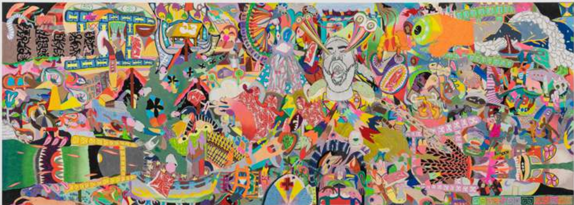
Mamabanha , 2021/2022 colored pencils, graphite, pastel, ballpoint pen, permanent marker, acrylic, oil and spray on paper 27.6 x 78.7 in