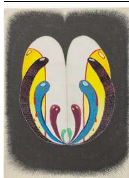
Meu guia , 2022 colored pencils, graphite, ballpoint pen and permanent marker on canvas 40 x 30 cm 15.7 x 11.8 x 0.8 in