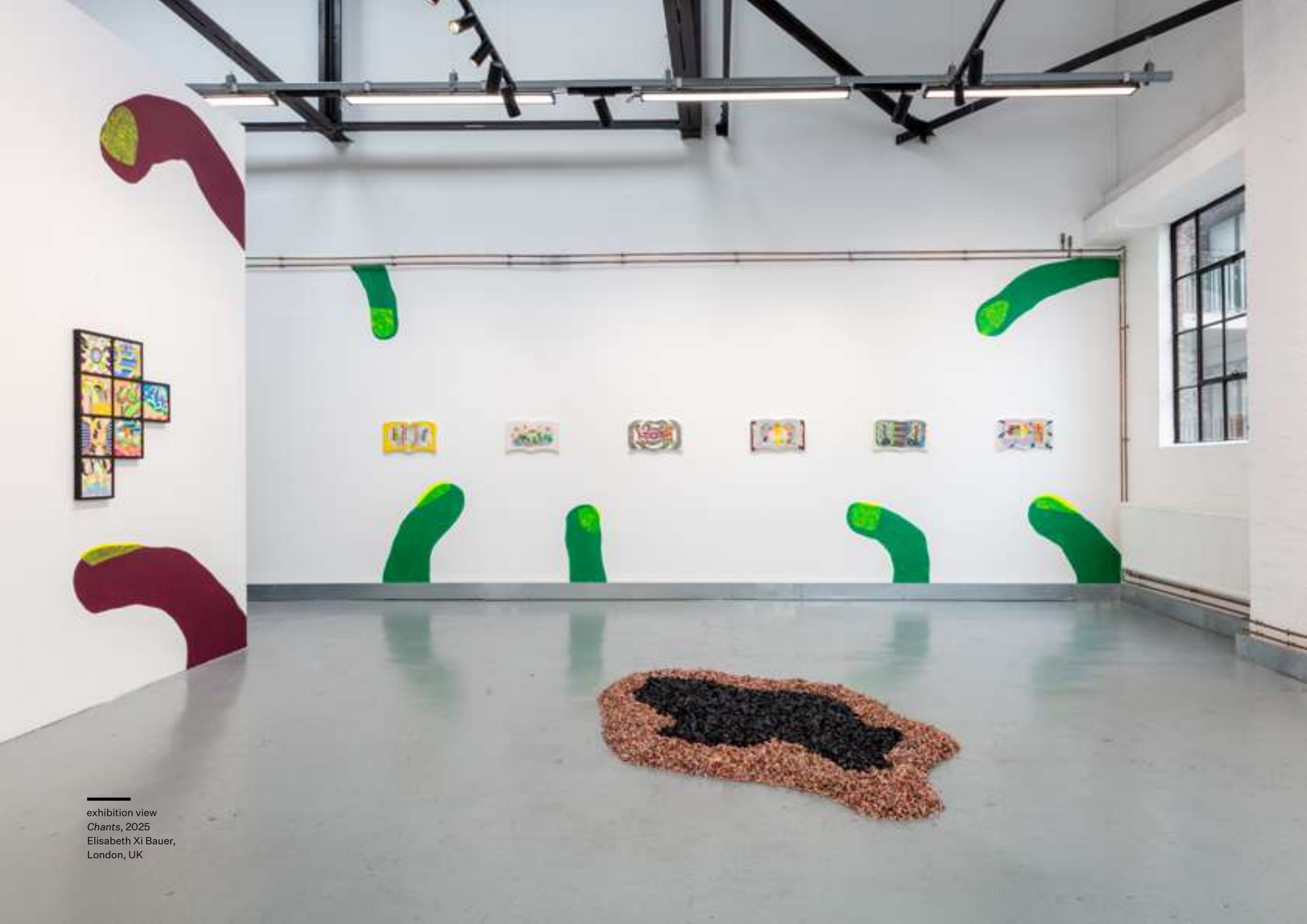
exhibition view Chants , 2025 Elisabeth Xi Bauer, London, UK