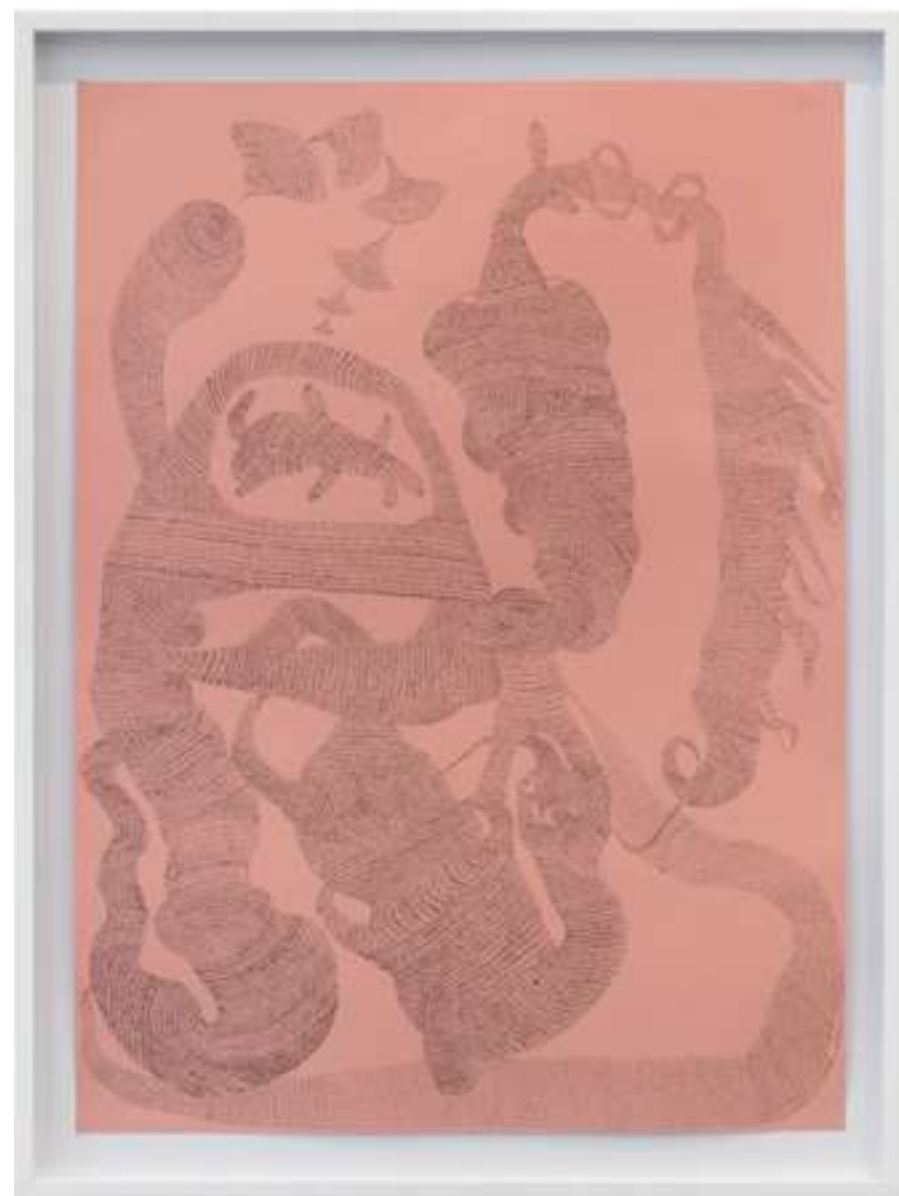
Instante I, 2018 graphite pencil on colored paper 47,5 x 65 cm | 18.7 x 25.6 in