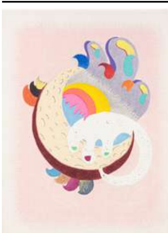
Waning moon , 2025 colored pencil, graphite pencil, ballpoint pen, oil paint and permanent marker on canvas 40 x 30 15.7 x 11.8 in