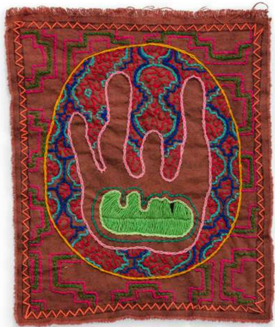
Prenúncio em Ucayali , 2020 embroidered in fabric with natural pigment and cotton 22 x 19 cm | 8.7 x 7.5 in

This contact drew his attention to the possibilities of drawing as a kind of visual writing that is not guided by principles of linearity, but which is still capable of carrying knowledge and communicating a tradition, as happens in many Amerindian cultures. Barbalho's encounters with Native American cultures with more peripheral aesthetics, that the artist had already previously incorporated, produced a collection of imagery in Barbalho's work about cultures and languages normally excluded from traditional history. Furthermore, themes of violence and conflicts between mass culture and tradition reverberate in the work.