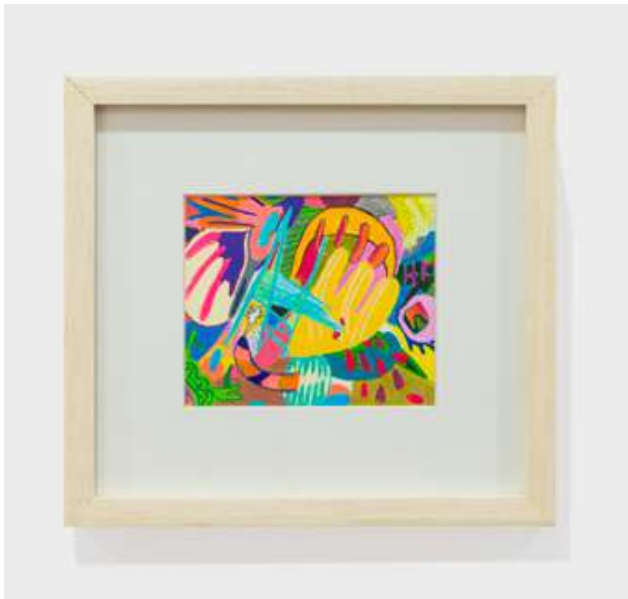
Miniworld I , 2019 graphite pencil, ballpoint pen, permanent marker, colored pencil and spray paint on canvas 8,7 x 10,4 cm 3.4 x 4.1 in