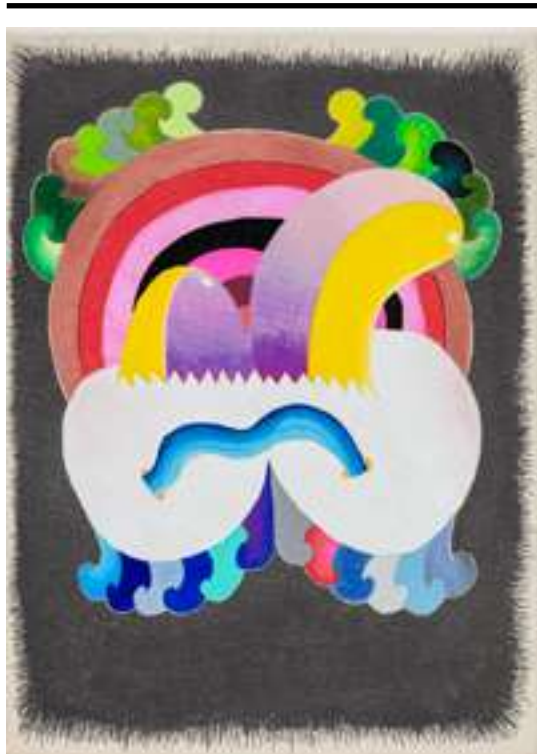
O menino não foi visto: nasceu , 2021 colored pencils, graphite, ballpoint pen and permanent marker on canvas 40 x 30 x 2 cm 15.7 x 11.8 x 0.8 in