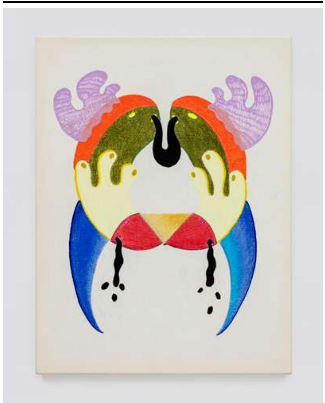
Metabolizei a maravilha , 2022 colored pencils, graphite, ballpoint pen and permanent marker on canvas 40 x 30 cm | 15.7 x 11.8 in

The titles of the works, in turn, seem to indicate various possibilities of meanings for the drawings. Metabolizei a maravilha (2022); O ninho não foi visto: nasceu (2021); Mãinha muito voraz (2022); Depois que entra ninguém sai (2021); Meu guia (2022) all radiate with a kind of wonder and mythology. The shapes on the canvas, which seem to fold in on themselves, as if they are observing themselves, seem to emulate our act of observing them, pointing to the fact that, when seeing them, they are added to us, and enter our imagination, which subsequently projects them on themselves again, in the painting.