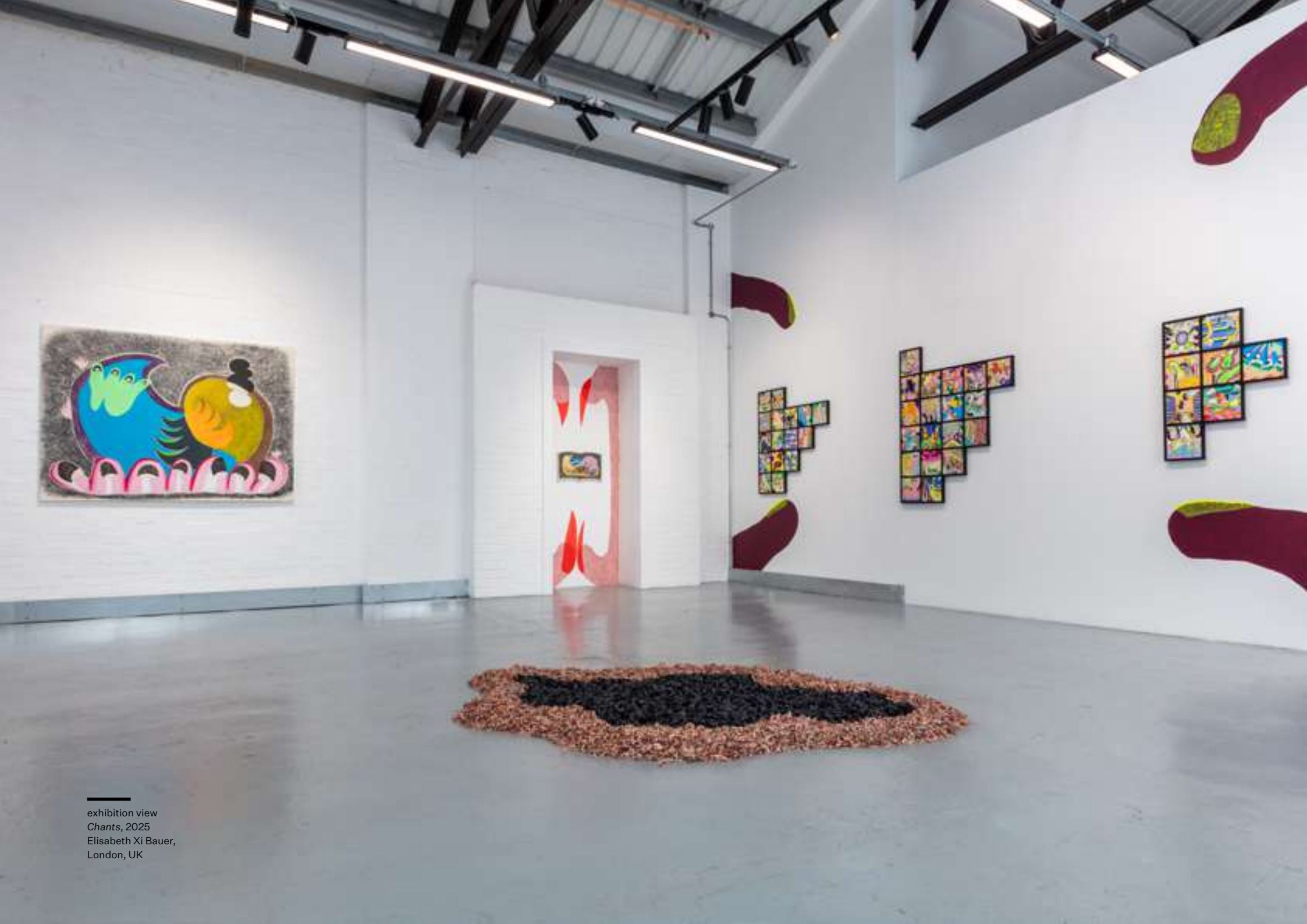
exhibition view Chants , 2025 Elisabeth Xi Bauer, London, UK