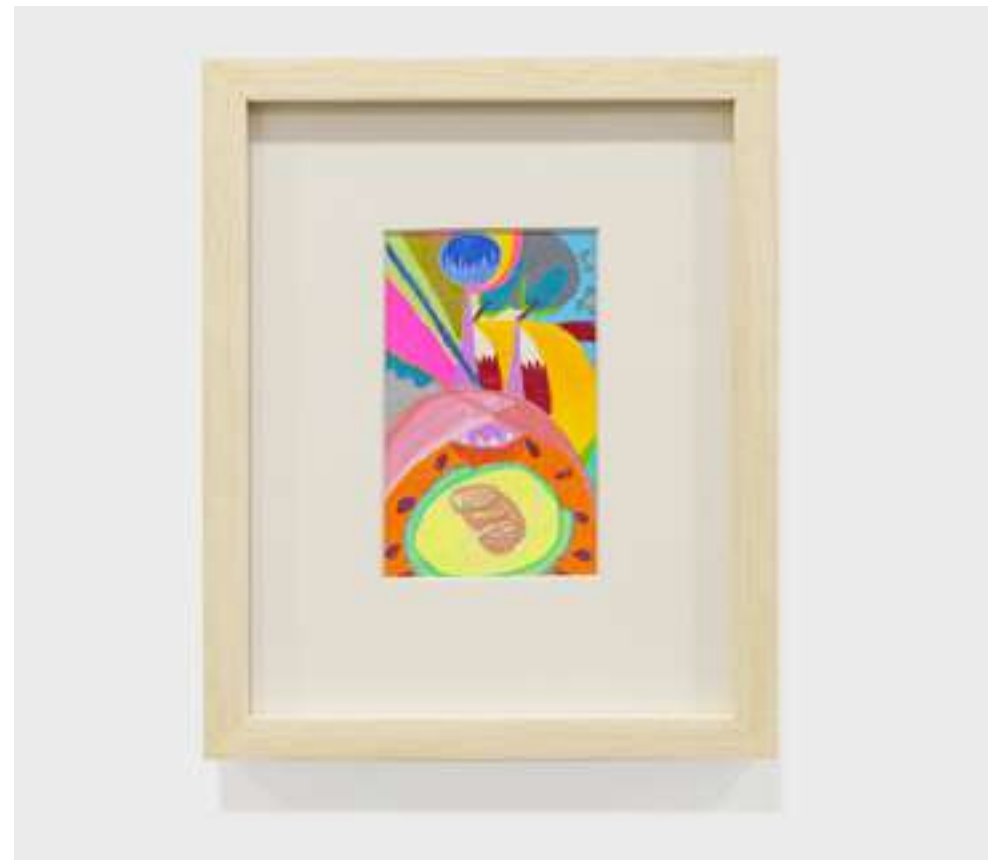
Miniworld III , 2019 graphite pencil, ballpoint pen, permanent marker, colored pencil and spray paint on canvas 8,7 x 10,4 cm 3.4 x 4.1 in