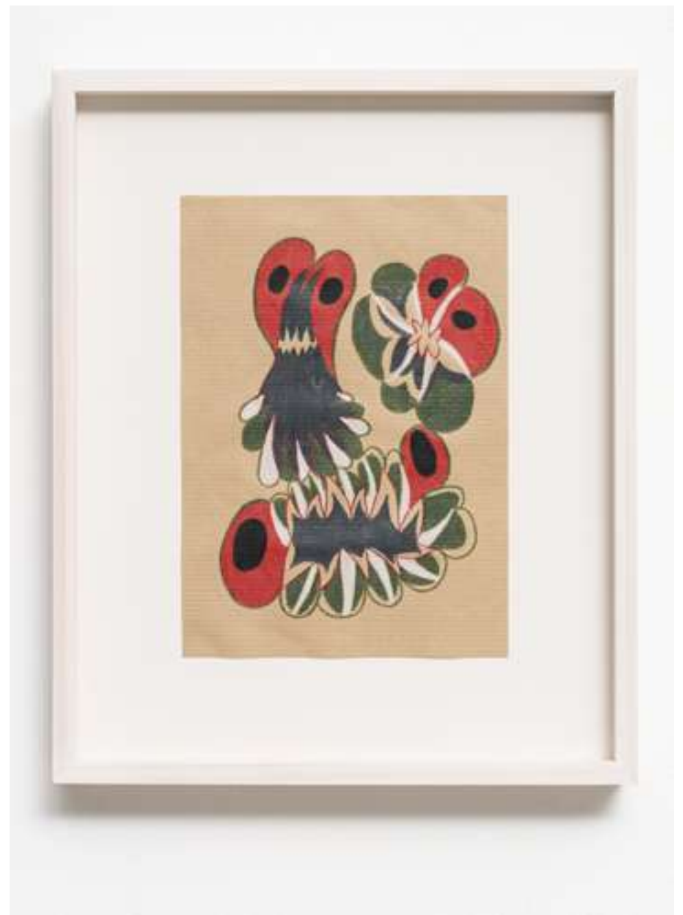
Made in China (Interior VII) , 2024 lápiz de cor, marcador permanente e caneta esferográfica sobre papel 21 x 15 cm