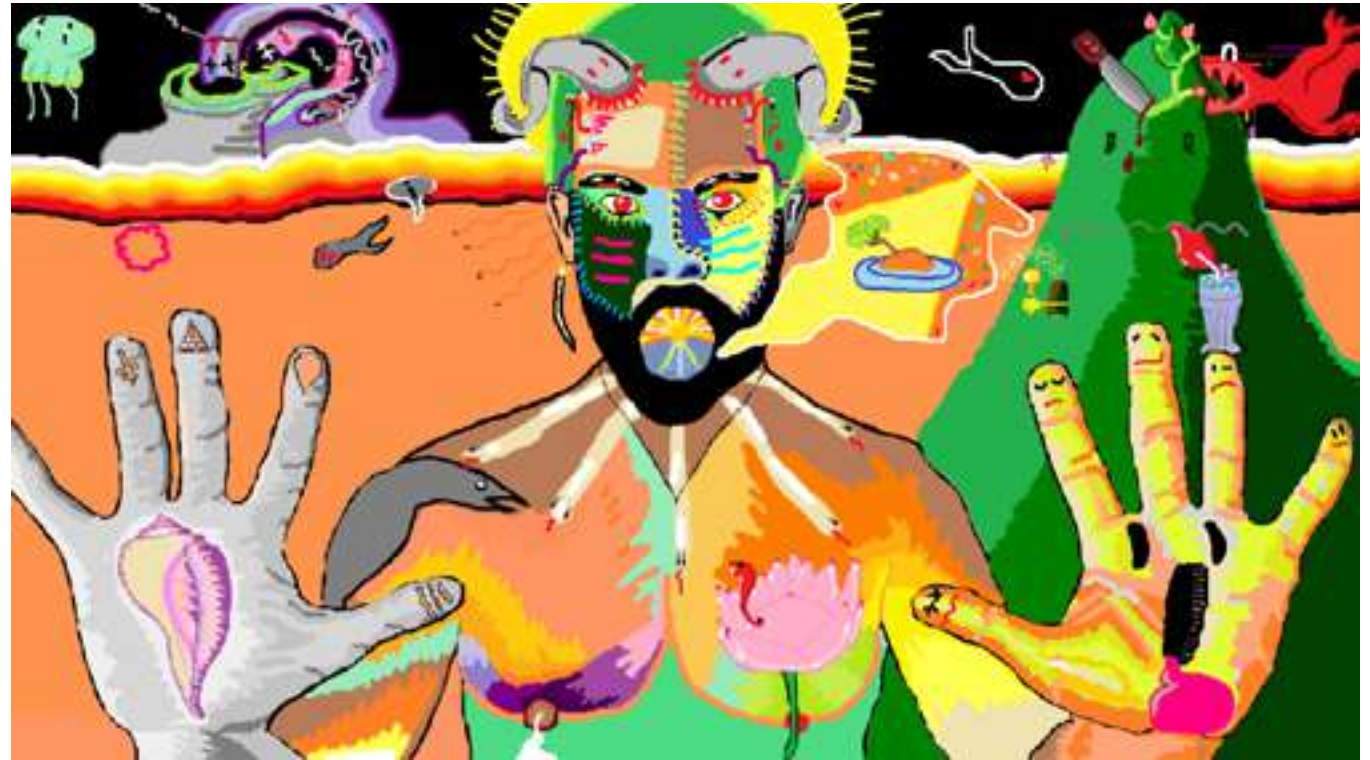
Untitled, 2015 paint brush variable dimensions

These incredibly detailed works bring many of the elements present in the artist's practice onto paper: profusion. In fact, this is one of the fundamental characteristics of Barbalho's work, where we find not only a variety of images, but also materials, colors and textures. The time it took to create each drawing—Barbalho did at most two a year—contrasts with the speed we attribute to the digital universe.