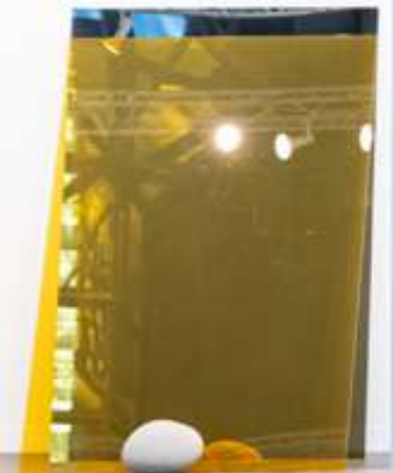
booth view Armory Show 2024