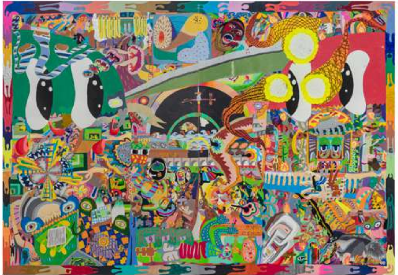
A redenção idiota , 2019 colored pencils, graphite, ballpoint pen, permanent marker, acrylic, oil and spray on paper 101 x 116 cm 39.8 x 45.7 in Pinacoteca do Estado de São Paulo

For Barbalho, drawing and writing have the same origin: action. They are undeniable marks left in the world that, in turn, always point to the existence of a subject who intentionally created them. They are statements by the individual. In this sense, the time taken to complete the work is a fundamental part of the process. The artist takes time to fill the entire surface of the paper with different shapes. However, unlike literature, these drawings do not build a linear narrative but instead, affirm the different temporalities that coexist in the world, creating an image that allows us to take different paths of narrative chaining as we follow Barbalho's drawings with our eyes.