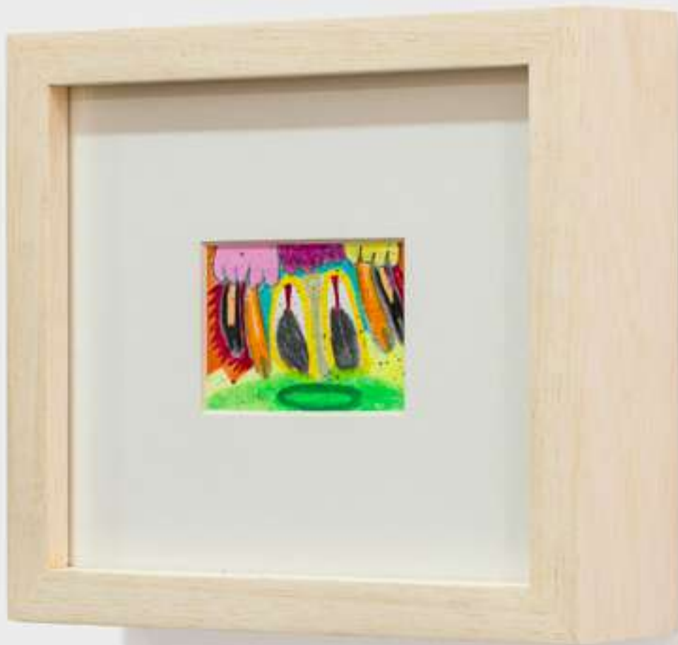
Miniworld II , 2018 graphite pencil, ballpoint pen, permanent marker, colored pencil and spray paint on canvas 4 x 5,6 cm 1.6 x 2.2 in